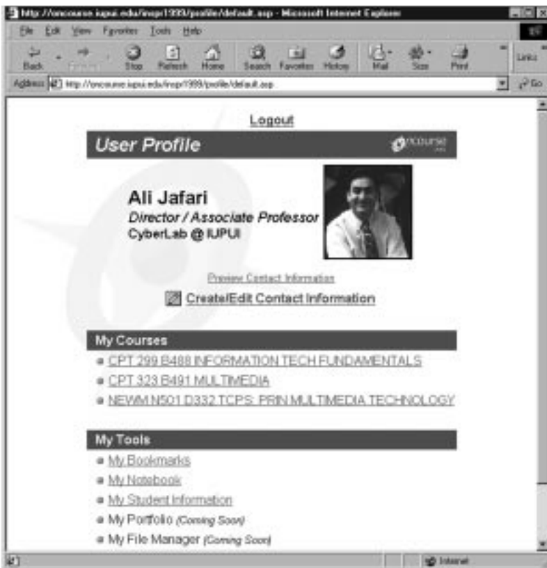
Figure 3. STEP 1: Login to Oncourse: Every student, faculty and staff can access their profile using their university computing ID, the same username and password used to access university email.

The framework and conceptual system of Oncourse consists of the following layers.