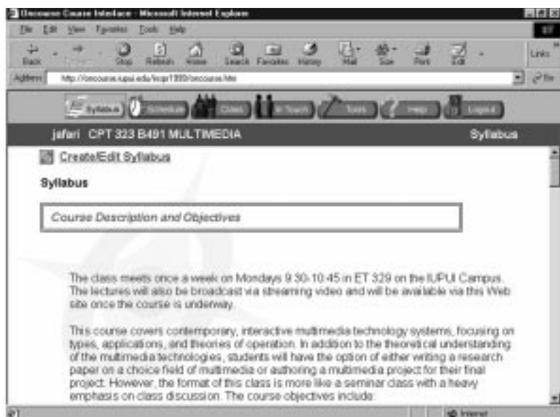
Figure 4. STEP 3: Use a Course Environment: Use the course template to navigate through the Oncourse course environment.