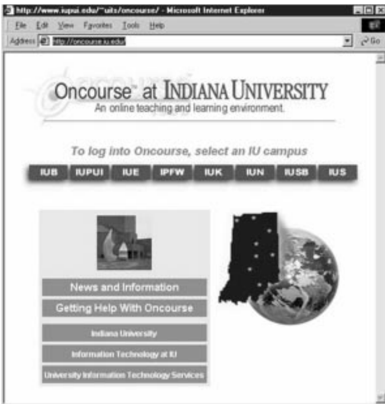
Figure 5. The Oncourse implementation in all eight campuses of Indiana University

Year 1999 continues to witness many higher education institutions not yet utilizing the World Wide Web and Internet for teaching, learning, and distance education. Although making web sites for a university and producing web pages for academic departments would provide a virtual image of a campus, universities needs to think more deeply and consider producing a web site or web environment for every course they offer in the university. This initiative not only provides a comprehensive virtual course offering catalog, but also offers an extensive teaching and learning environment that can complement every traditional course while opening new doors and opportunities for the twenty-first century paradigm shift in teaching and learning. The list below offers ten reasons why universities and colleges should offer a web environment for every