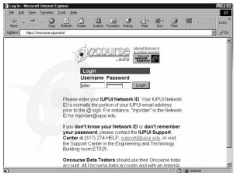
Figure 2. STEP 1: Login to Oncourse: Every student, faculty and staff can access their profile using their university computing ID, the same username and password used to access university email.

Defining the big picture not only aids in the understanding of all possible functional