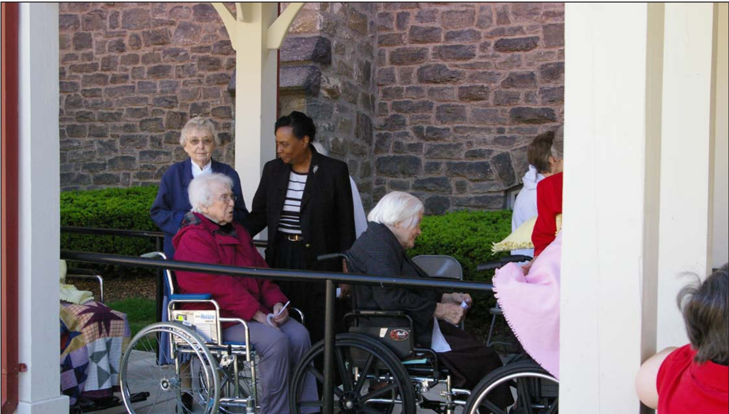
Some sisters lined up to watch the ceremony and to see the cross.