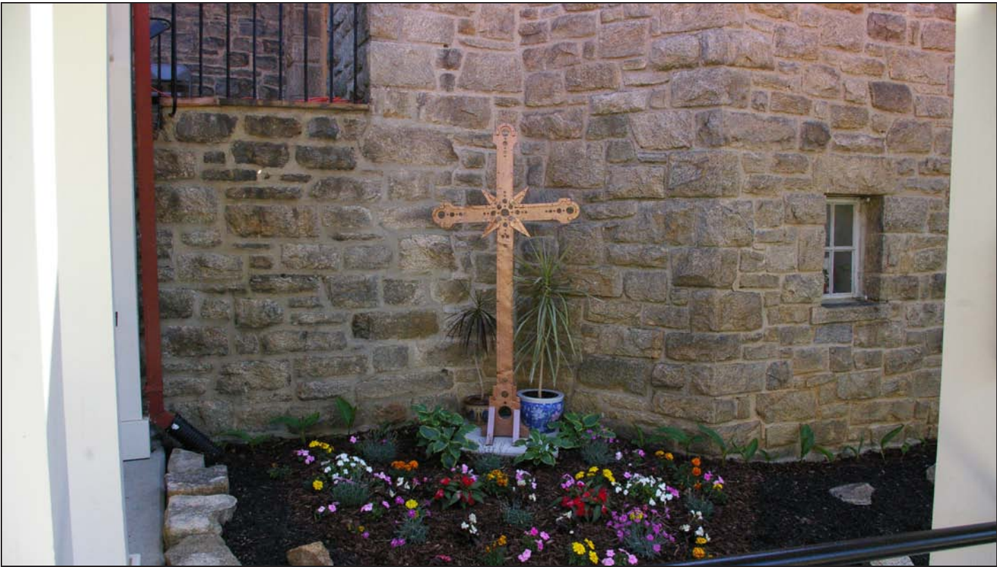
The Holy Providence Cross.