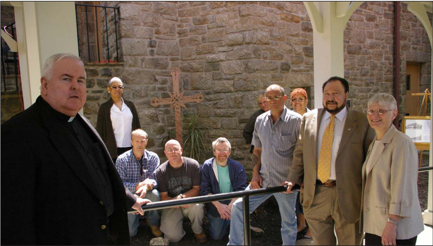
Group pictures around the cross.