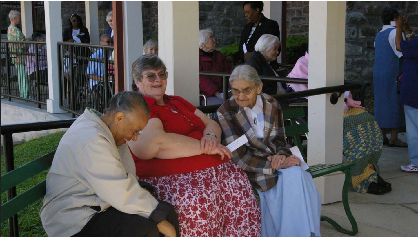
Sisters enjoying the ceremony and the weather.