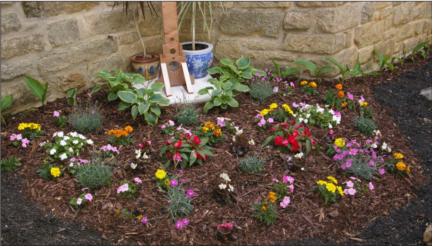
Beautiful and colorful plantation surround the cross once buried for nearly 40 years.