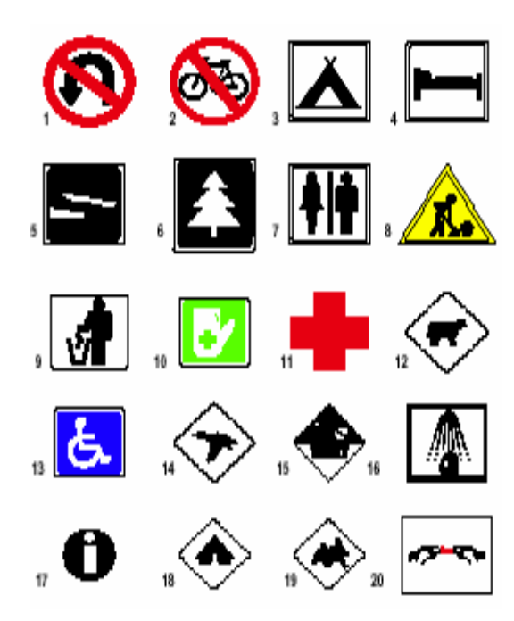
The following answer list is in the same order as the picture. Be sure to scramble the list before giving it to boys to match picture to meaning.