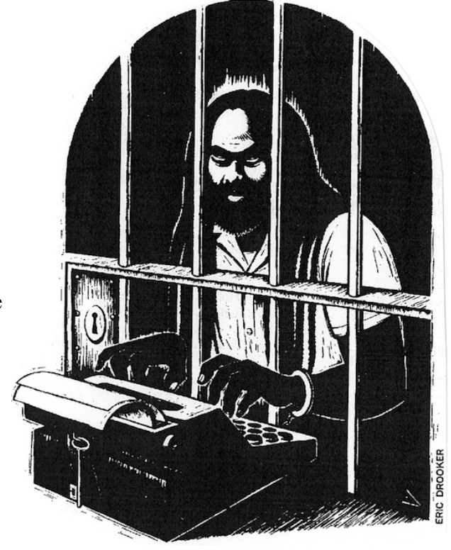
Mumia Abu-Jamal is an internationally renowned political prisoner and journalist. Like most other Hep-C infected prisoners in the US, he is being denied medically-recognized treatment for the disease.

All those who used dirty needles in the 1970's or 80's, or who got tattoos back then, or who had blood transfusions which were tainted with the virus, are just now coming down with this dreadful disease. This clearly effects a huge proportion of prisoners, mostly people of color, as well as veterans and other working and poor people.