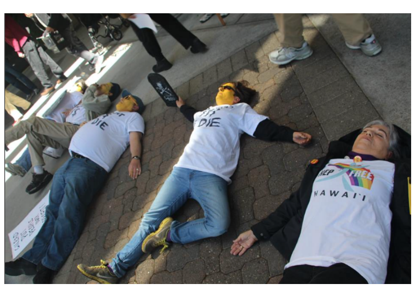
Die-in at Gilead HQ: "Gilead's stocks are rising,-- Hep-C patients are dying"

This price-gouging--at least 100 times above the actual cost of production-has threatened death to prisoners, veterans and other poor and working people who cannot afford it, or whose insurers deny it due to its high cost. Gilead's price is exacerbating a financial crisis in Medicare and Medicaid, as well as a funding logjam at the Veterans' Administration, and prison administrations across the US.