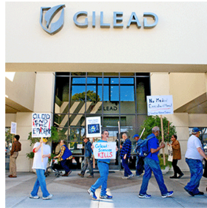
US: Protestors at Gilead's Corporate HQ, April 1st.

Big Pharma corporations have been raising prices of essential medications to outrageous levels in recent years, and Gilead Sciences is right down there with the worst of them. Gilead is the manufacturer--but not the original developer--of the drug Harvoni, which is a vast improvement over previous treatments for Hepatitis-C (HCV). One