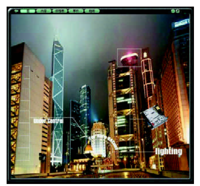
Figure 5: The cover graphic for the lighting system. As with many other graphics in this project, it highlights the fact that BACnet is in control.

One non-BACnet interface was used with the building automation system. A power monitoring station came with a built-in Web page interface. Since the BAS also used a Web interface, it was a simple matter to integrate the power system screens into the building automation system. However, a limitation to this interface is that it does not provide a machine-friendly interface to the building control system. The HTML