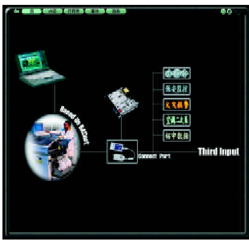
Figure 4: BACnet interface to third-party equipment.

Two major milestones occurred in the construction program. The first was to complete the meeting halls and conference facilities needed to host the Asia-Pacific Economic Coopera-