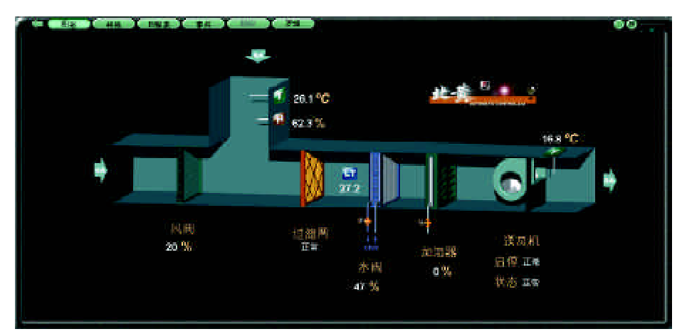
Figure 2: Typical air-handling unit. The museum has more than 100 air-handling units.

The fire and life-safety system was similarly linked to the central system through a gateway. This made approximately 200 data points available to BACnet, including the status of pull stations, smoke detectors, and fire suppression pumps. The gateway module made this information avail-