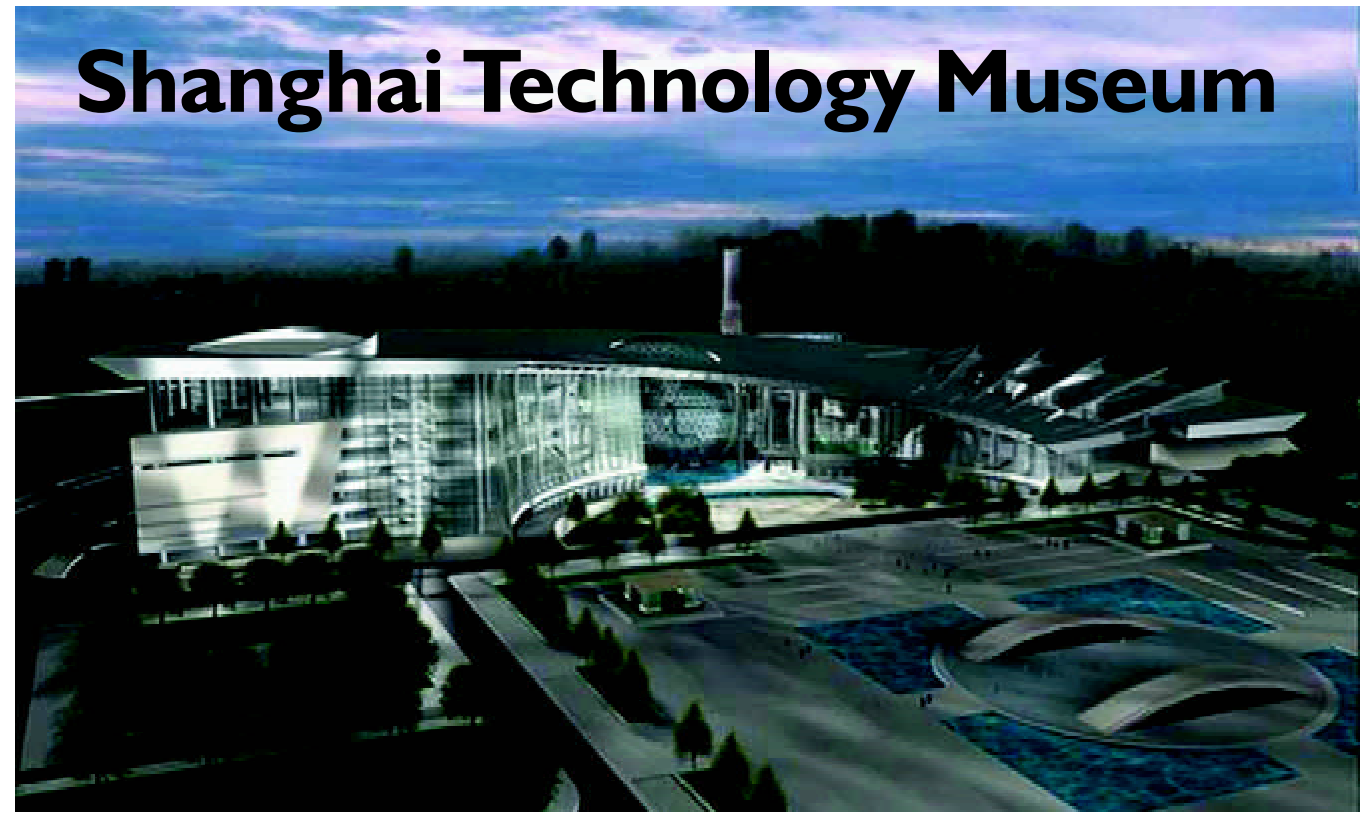
The Shanghai Science and Technology Museum plans displays of its BACnet system so that visitors can see how it works.

The following article was published in ASHRAE Journal, October 2002. © Copyright 2002 American Society of Heating, Refrigerating and Air-Conditioning Engineers, Inc. It is presented for educational purposes only. This article may not be copied and/or distributed electronically or in paper form without permission of ASHRAE.