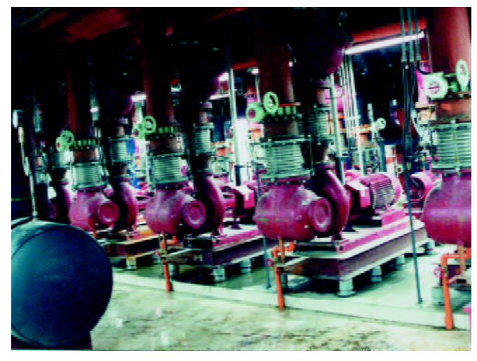
Figure 3: Variable speed pumps are controlled by variable frequency drive control panels.

able to the central system, generated BACnet alarms as appropriate, and controlled safety interlocks with other BACnet equipment such as fans and AHUs.