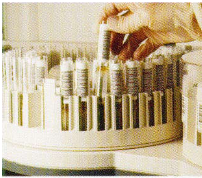
Using bar-coded stickers to identify and track lab specimens increases efficiency while decreasing the risk of tracking errors.

The hospital has many CICS applications handling patient information, financial data, and other information vital to the hospital. To route output from all