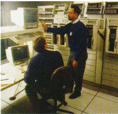
The IS department offers hospital staff flexibility in output management, using VPS to print to remote printers, centralized printers, or via a fax server.

To discuss your organization's current print strategy and ensure that it can meet the expanding needs of your enterprise, contact the enterprise print management specialists at Levi, Ray & Shoup. Whether your interests are cost savings or increased performance, LRS can provide the products and the expertise to fit your needs.