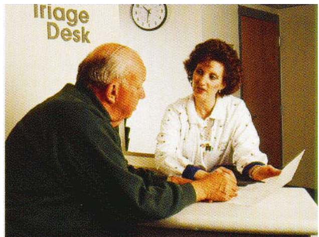
By implementing AFP and VPS/IPDS, West Allis Memorial was able to eliminate a six-part preprinted admissions form. This move saved over $25,000 in the first year.