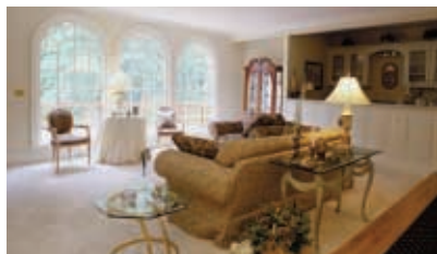
LOTS OF ENERGY

To be relentlessly pursued about these or any other properties, please call me at (800) 555-3214.