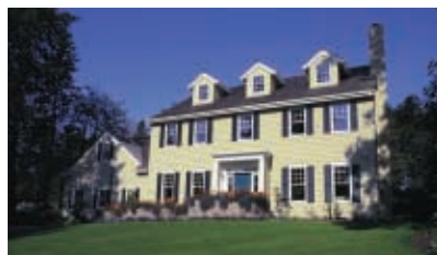
“INEXPERIENCED BUYERS” PREFERRED

4 BR, 2 bath. Antique plumbing, Rancid smell galore! Electricity on occasion, worn-out carpeting for homey feel. $785,000