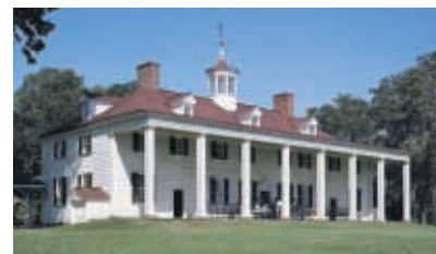
PRIME TARGET FOR BREAK-INS!

5 Bedroom, 2.5 bath, 2 fireplaces, 2 car garage, hardwood floors, neighbor enjoys late night screaming. $1,650,000