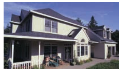
PERFECT NEIGHBORHOOD IF YOU'RE IN A CULT

2 BR, old-world charm, outdoor plumbing, outdoor bath, outdoor shower, outdoor kitchen, parking on street. $470,000