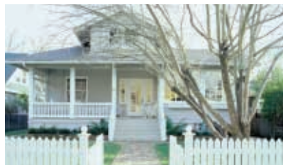
BUY NOW! ROOF ABOUT TO COLLAPSE!

2 BR, 4 baths, one-level ranch house, in walking distance of nuclear power plant, dishwasher included. $559,999