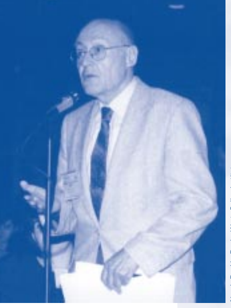
Questions from the audience ranged from queries about the need for lifestye changes to the need for lifecycle costing, as well as numerous other issues.

"I'm convinced that the more the American people understand what could be lost if we don't act, and what could be gained if we do, the more likely they are to support an international agreement."