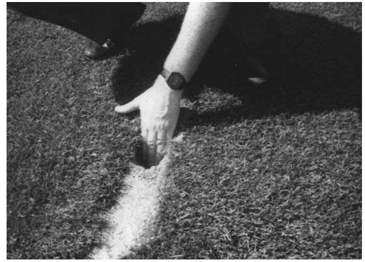
A 3-inch-wide slit drain just after installation.

enough into a drain pipe through the turf, soil, and backfill material.