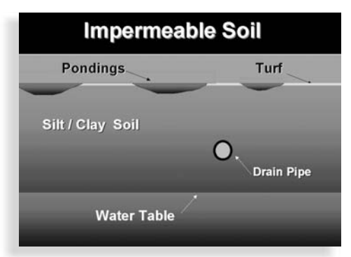
Impermeable soil condition. Conventional drains installed in the drier subsoils will not address the problems at the surface.

The principal of slit drainage is to remove excess surface water before it has a chance to pond and then soften the ground