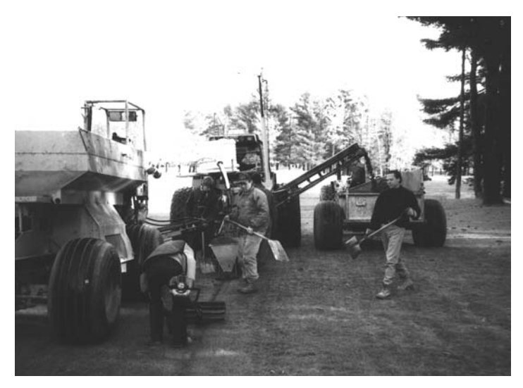
Specialized equipment installing 1.5-inch-diameter slit drains in a one-pass operation.