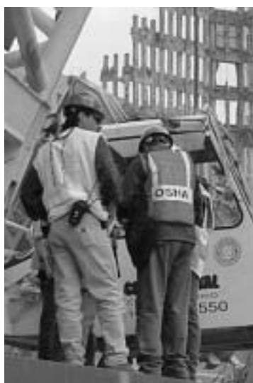
Photo 14 (top): The north face of 130 Liberty St. The broken windows were eventually covered completely with protective, flame-retardant netting.