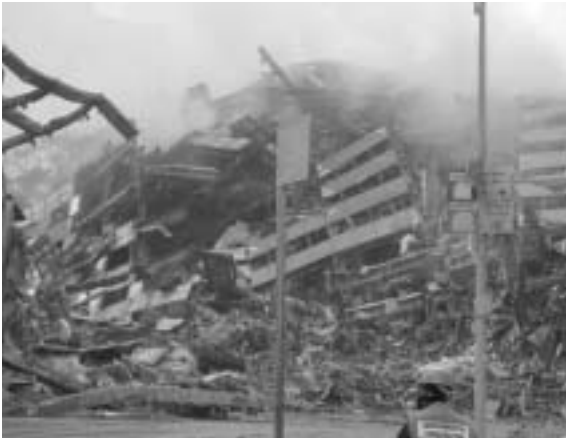
Photo 2 (above, left): WTC-7, a 47-story building destroyed in the attacks.