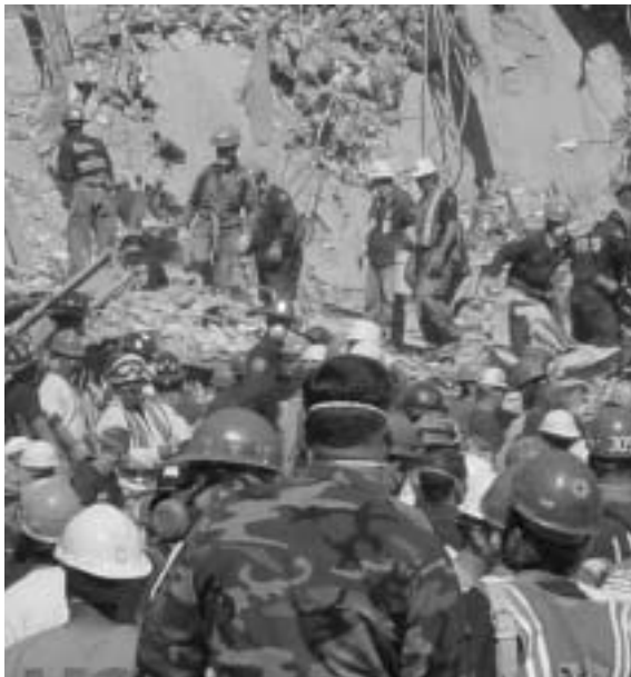
Photo 5 (above): The site was flooded with people trying to assist, many wearing no or improper PPE.