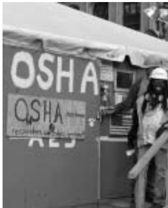
Photo 6 (above, right): One of OSHA's PPE distribution centers and respirator fit test stations near the disaster site.