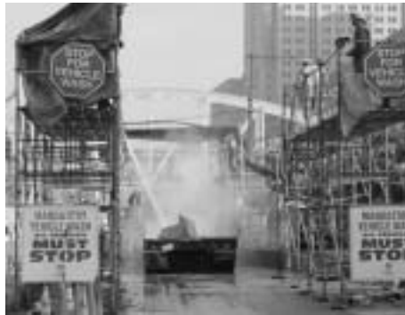
Photo 10 (below, right): A massive amount of heavy equipment was mobilized to assist in the recovery effort. This photo shows only the southwest corner of the 16-acre site.

Photo 9 (right): Laborers clean 1 Liberty Plaza. At the time the work was being performed, consistency of the dust was not known.