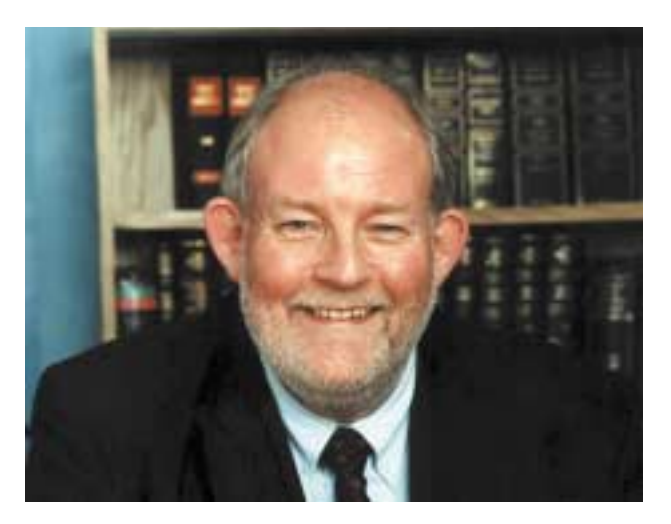
E-learning has the potential to revolutionise the way we teach and how we learn.

A great deal of progress has been made so far, but there is much more to do. E-learning can take us a further step forward. This is about embedding and exploiting technologies in everything we do, and getting ICT embedded across the curriculum for all subjects and in all pedagogues. E-learning has the power to transform the way we learn, and to bring high quality, accessible learning to everyone – so that every learner can achieve his or her full potential.