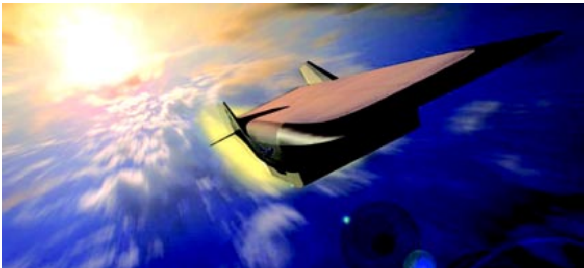
An artist's rendering of the X-43C hypersonic flight demonstrator, scheduled to take wing for flight testing by 2008.

Imagine being able to take off from a U.S. airport and travel to space at a price comparable to flying aboard the Concorde jet. Technology now being developed by NASA and its partners might achieve such highly reliable and low cost access to space in less than two decades, yielding limitless possibilities for space travel, such as space commerce and tourism.