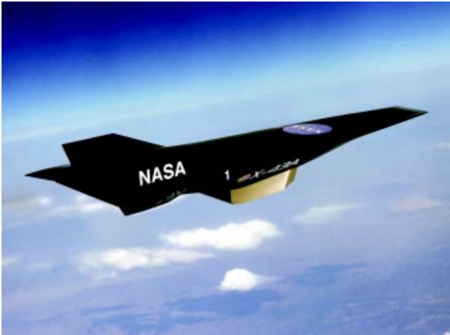
The X-43A flight demonstrator, scheduled to be tested in flight in 2003.