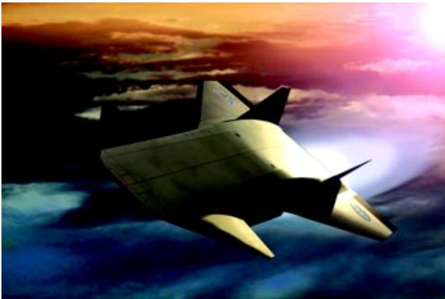
An artist's rendering of a future Hyper-X series flight demonstrator, which could fly later this decade based on the success of the X-43A and X-43C projects.

The X-43A, an unpowered research craft mounted atop a modified Pegasus booster rocket, first flew in June 2001. An in-flight incident forced the mission to be aborted. The second X-43A demonstrator, built in 2002 at Dryden Flight Research Center at Edwards Air Force Base, Calif., is being prepared for flight testing in 2003. Fueled by hydrogen, the X-43A is intended to achieve Mach 7, or approximately 5,000 mph.