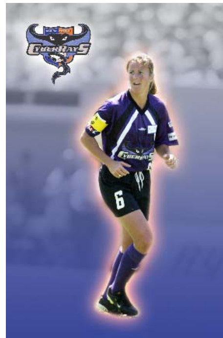
Brandi Chastain anchors the San Jose defense.