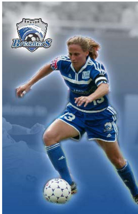
Kristine Lilly ended 2002 with a 10-game point-scoring streak.