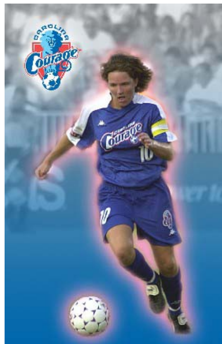
Hege Riise will lead Norway into the Women's World Cup.