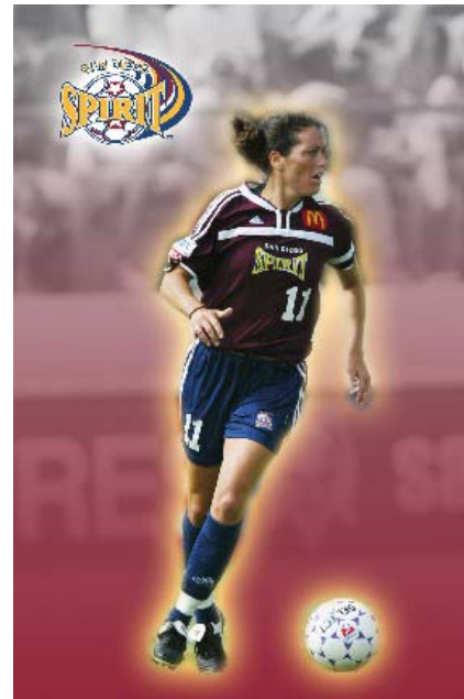
Julie Foudy is the captain of the U.S. national team.