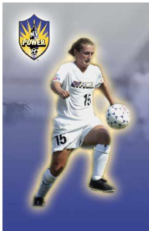
Tiffeny Milbrett is the WUSA's all-time leading scorer.