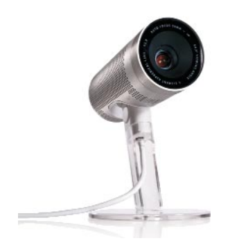
Apple's iSight camera works with iChat AV for effortless video and audio conferencing.

An automatic video preview window lets you check your lighting and camera position before you begin your conference. A picture-in-picture window displays the video stream so you know exactly what your buddy is seeing. Audio mute and video pause are both available for when you need a moment of privacy.