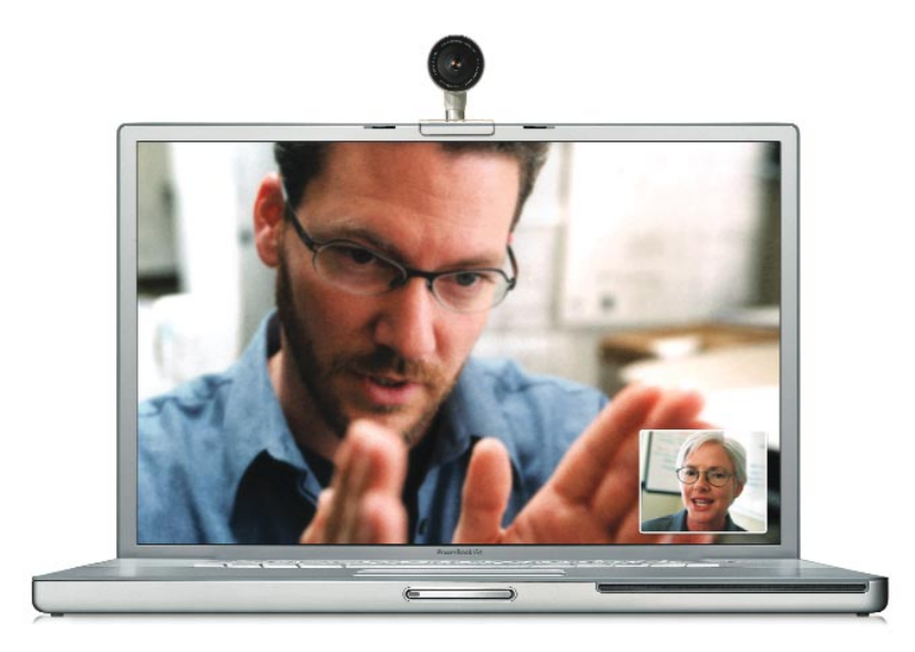
iChat AV enables high-quality, full-screen video conferencing over the Internet.

An innovative new feature of Mac OS X version 10.3 "Panther," iChat AV works with iSight and other FireWire-based cameras, including DV camcorders.