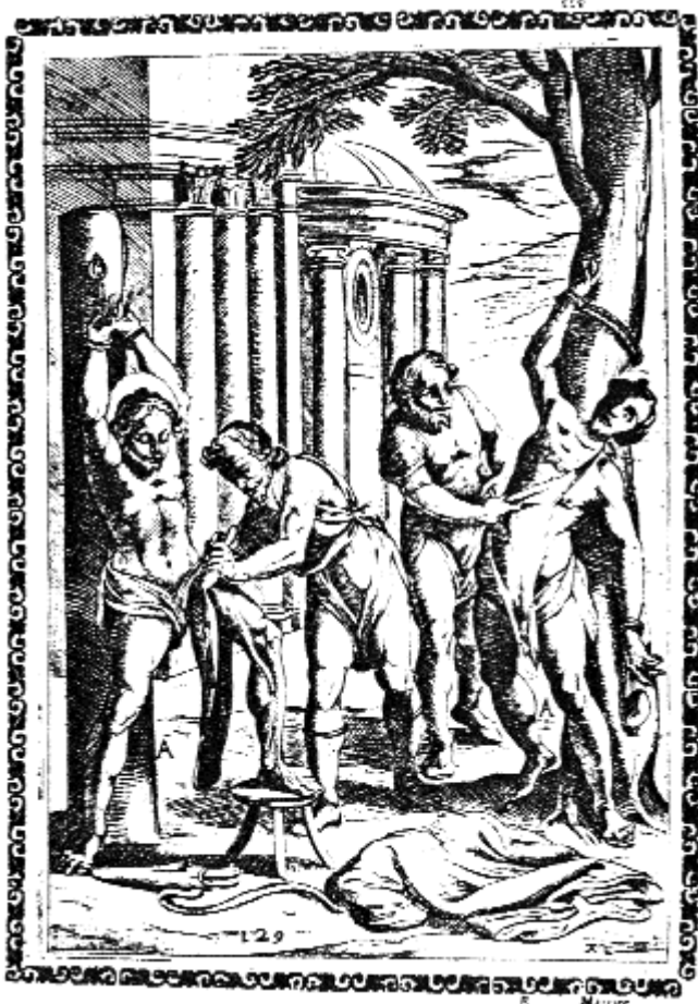
A. Martyrs being flayed alive.