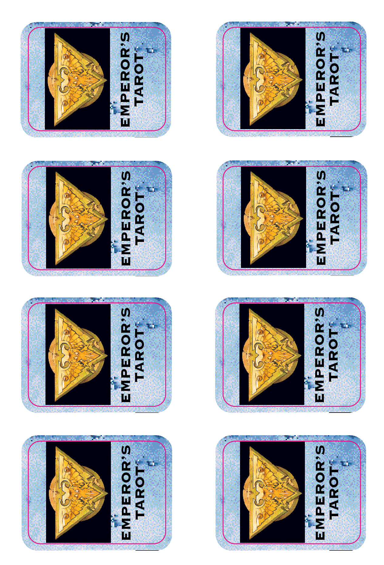
Copyright © 1997, 2001. Games Workshop Ltd. All rights reserved.