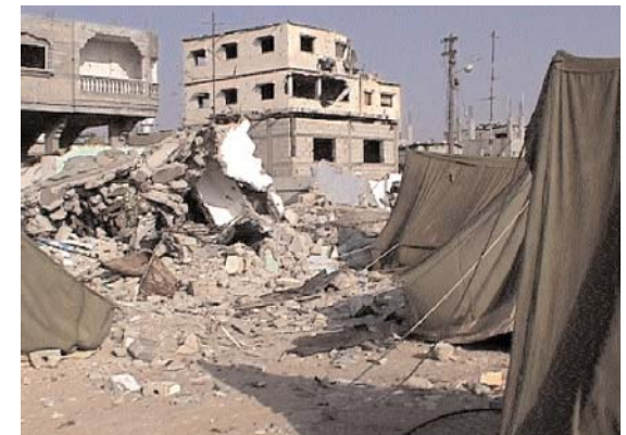
Tents on the site of a demolished house in Khan Yunis

At 11.20pm on 10 April 2001 a number of tanks accompanied by three bulldozers crossed over al-Tuffah checkpoint in the Gaza Strip from the Gush Katif settlement block. The incursion took place without warning and according to news agencies there was a six-hour barrage of fire on homes before the bulldozers started to demolish houses near the checkpoint.