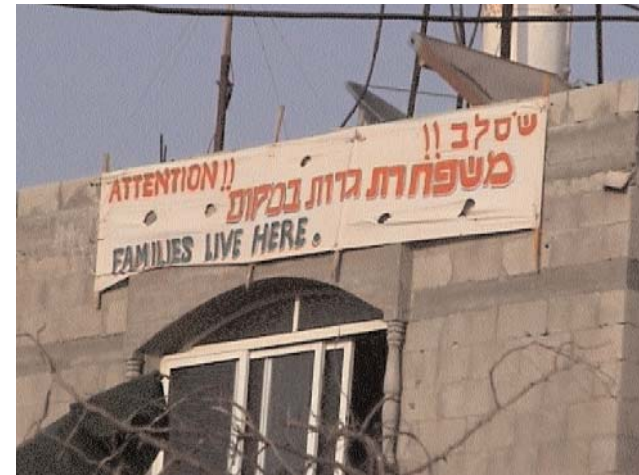
House in Khan Yunis, July 2001

"Following the continuous shooting attacks that have recently occurred in the area of the community of Neveh Dekalim, including mortar bomb fire, IDF forces operated last night to destroy the Palestinian buildings from which shootings were perpetrated in order to prevent further terror attacks against civilians and soldiers."