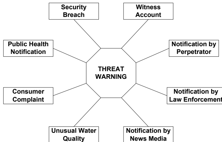
Figure III-2. Summary of Potential Threat Warnings