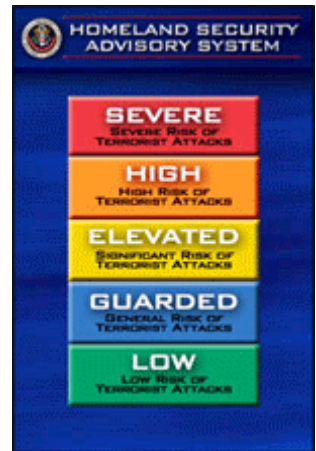
Figure III-1. Threat Condition Levels

A “threat warning” is an occurrence or discovery that indicates a threat of a malevolent act and triggers an evaluation of the threat. These warnings should be evaluated in the context of typical CWS activity and previous experience in order to avoid false alarms. The threat warnings presented in Figure III-2 and described below are intended to be inclusive of those most likely to be encountered, but this listing is by no means comprehensive of all possibilities.