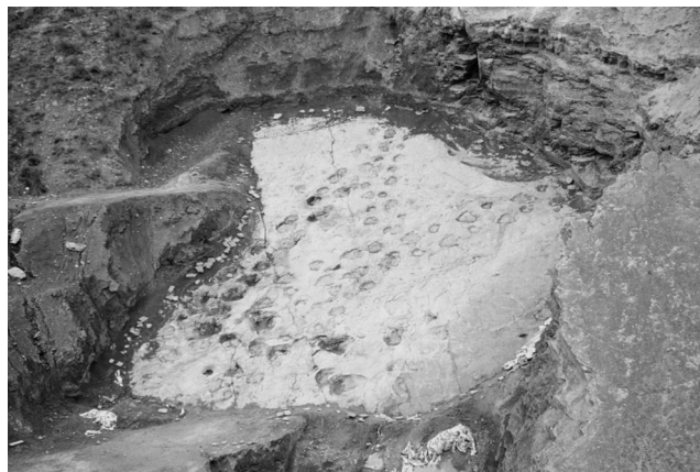
FIGURE 2. The Yanguoxia dinosaur footprints site, Yongjing County, Gansu Province.