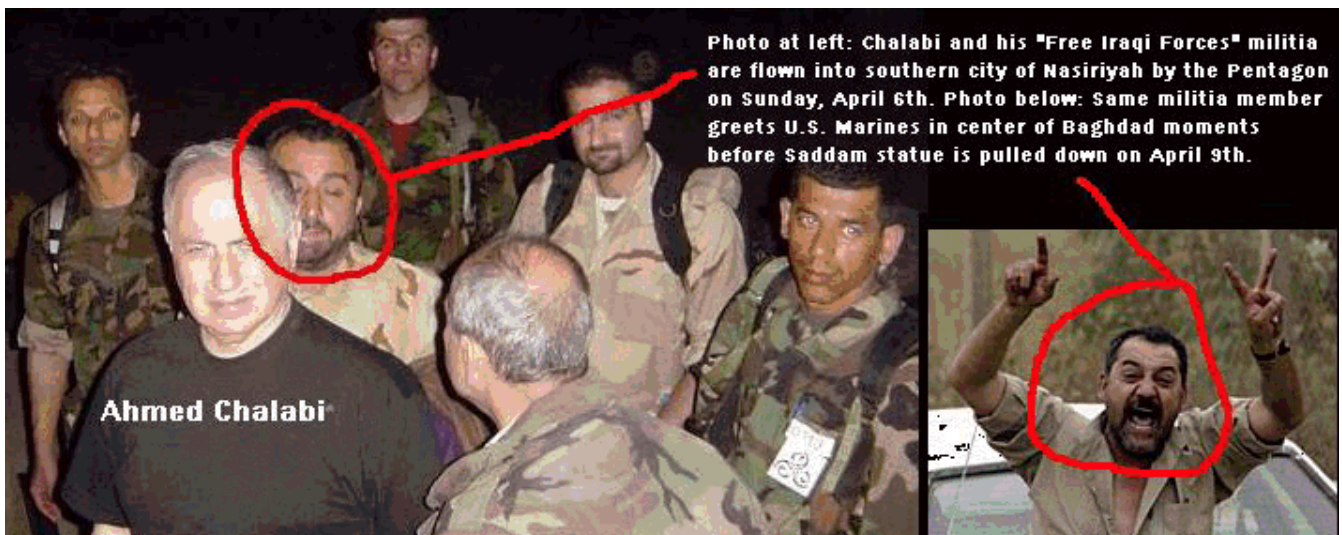
Photo at left: Chalabi and his "Free Iraqi Forces" militia are flown into southern city of Nasiriyah by the Pentagon on Sunday, April 6th. Photo below: Same militia member greets U.S. Marines in center of Baghdad moments before Saddam statue is pulled down on April 9th.

All this demonstrates the complete sham of so much of this American campaign to gain support for their illegal invasion and occupation of Iraq. Give me one reason why the Iraqi people should see the USA as