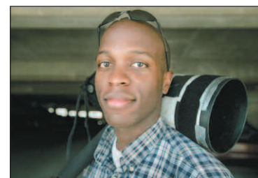
Vernon Bryant, staff photographer; 2000 news photo intern