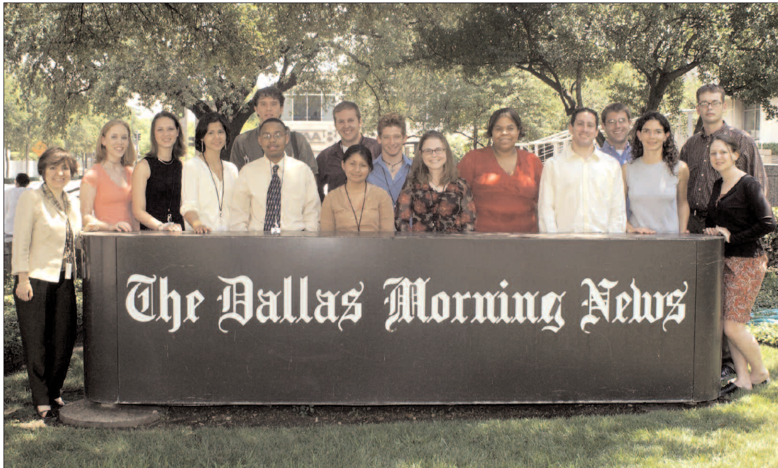
Class of 2003

T he Dallas Morning News , Texas' leading newspaper, offers a variety of newsroom internships including the news, copy editing, business, features and sports departments. Additional internships are available for photography, graphic arts, editorial writers and the reference department.