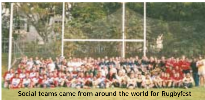
Social teams came from around the world for Rugbyfest

T he newest competition during rugby week in Hong Kong is proving to be popular. Kowloon's Rugbyfest 10s is a promising social tournament for those who prefer to enjoy their rugby madness with more pints than bruises. This one-day extravaganza of champagne and rugby takes place on Wednesday March 26, 2003 at So Kon Po.