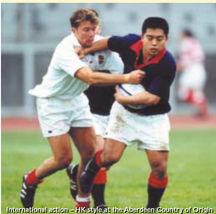
International action - HK style at the Aberdeen Country of Origin