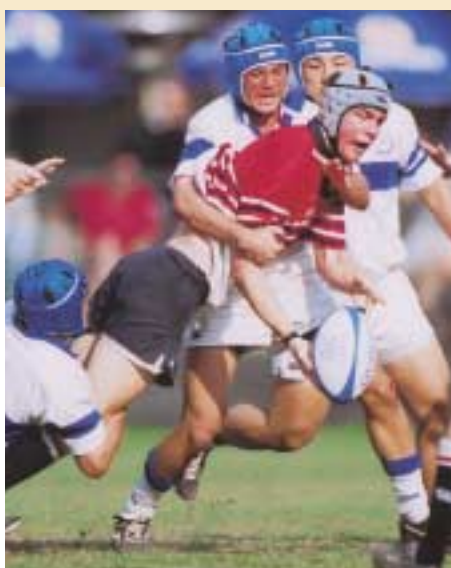
The Hong Kong SAR U19 qualified for the 2003 World Junior Championship in France