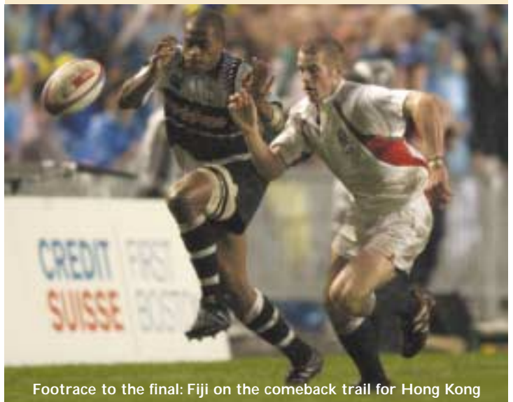
Footrace to the final: Fiji on the comeback trail for Hong Kong

With Fiji, Argentina, Namibia and Italy (who won the Shield) taking titles, the silverware was shared between four continents, a fitting tribute to the vibrant internationalism of the global festival that is sevens rugby. RT