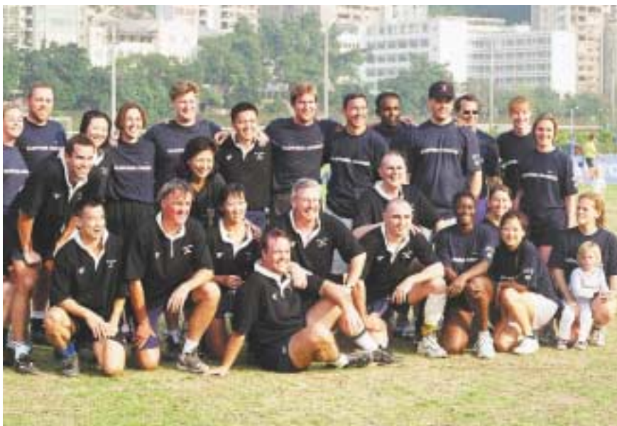
Reaching out through touch rugby: the finalists from the Inter-Law Firm Touch Rugby Carnival Charity

All together, approximately HK$200,000 was raised, making the Inter-Law Firm Touch Rugby Carnival a great way to reach out for those in need. RT