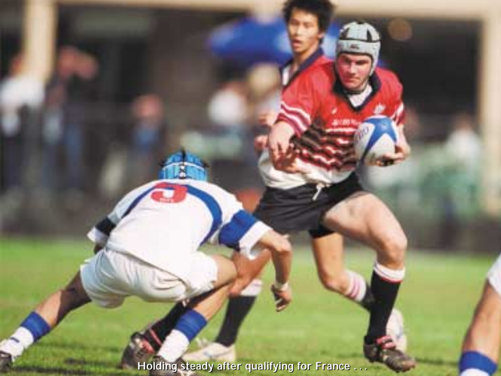
Holding steady after qualifying for France ...

starters against Japan leading to an understandable 89 - 0 rout in Hong Kong's last pool match.