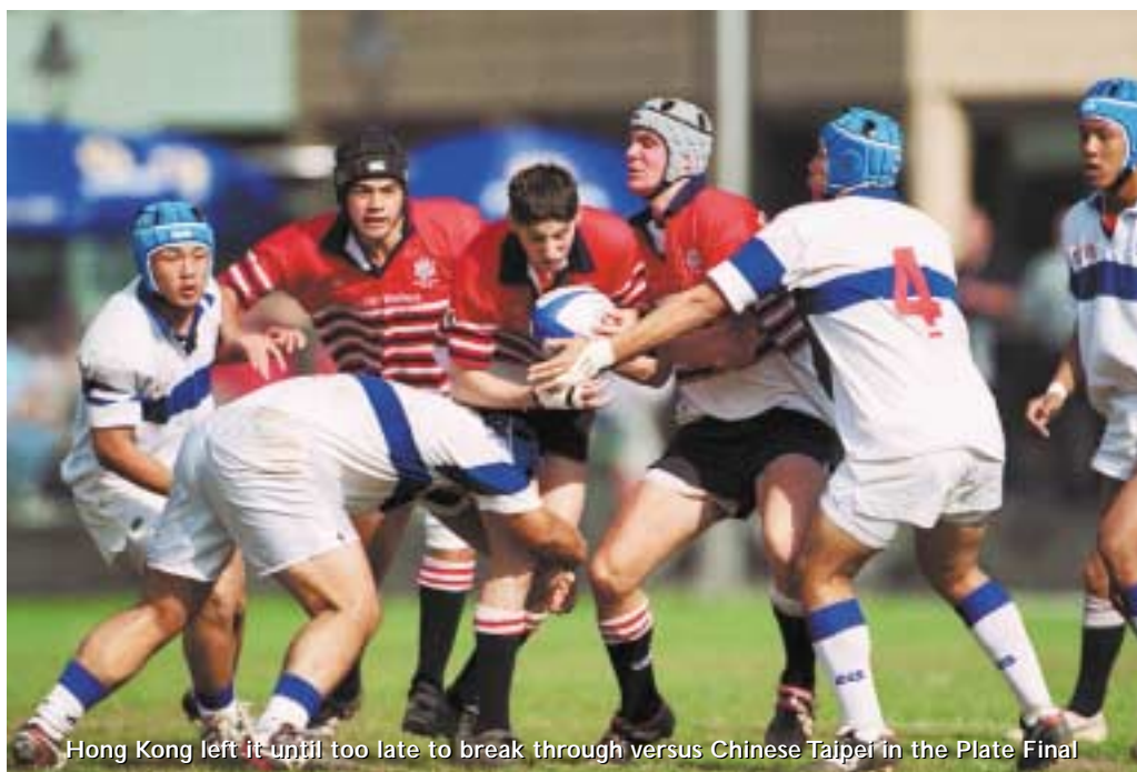
Hong Kong left it until too late to break through versus Chinese Taipei in the Plate Final