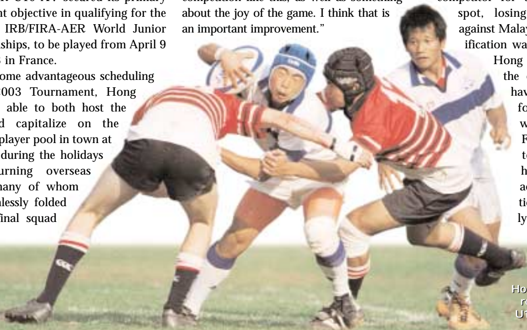
Hong Kong met their closest regional rivals in the ARFU U19 Tournament Plate Final