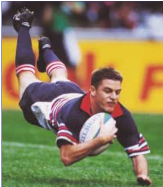
The SAR will be ready to dive in at this year's HK Sevens