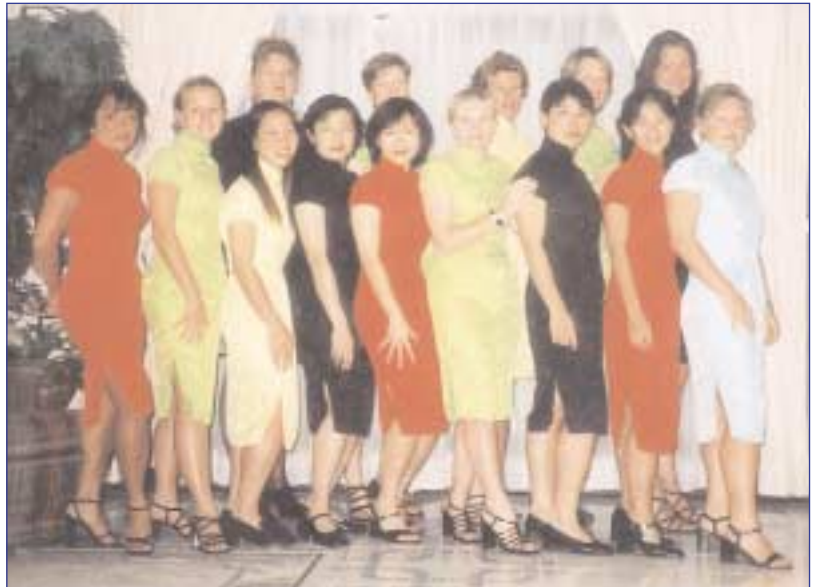
DeA Ladies looking good off and on the pitch

The match against Doha was the most evenly contested, with DeA edging out 20 – 10, and winning the tournament on the back of an undefeated weekend.