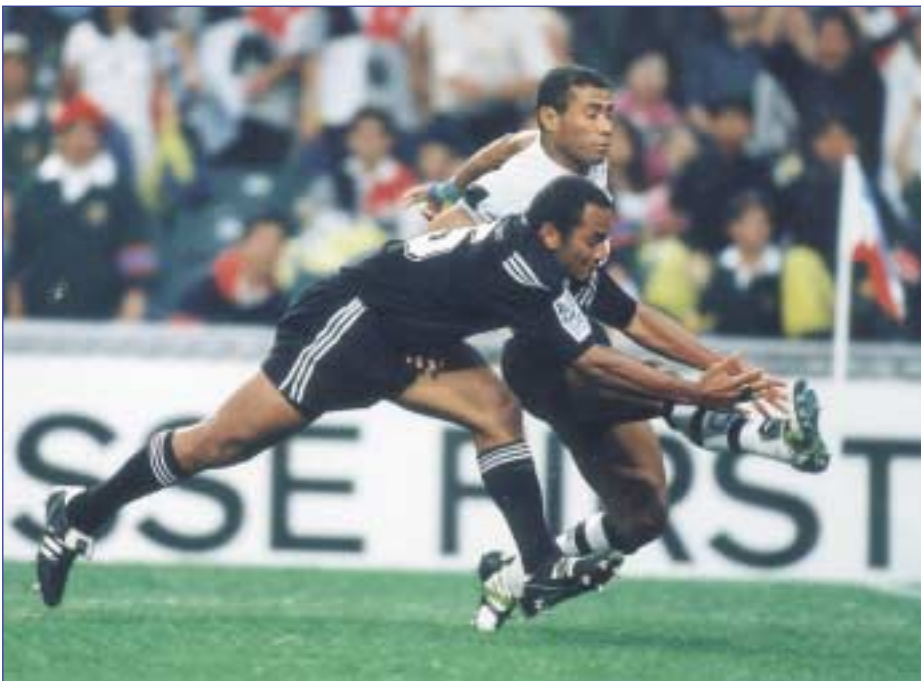
... left everyone missing the supposedly scripted Fiji-NZ final

有份出席世界盃七人欖球賽決賽週的廿四支球隊中，其中十七隊將來港參加在三月三十日至四月一日舉行的2001瑞士信貸第一波士頓香港國際七人欖球賽，爭奪高達150萬美元的總獎金，屆時香港的球迷將可大飽眼福，於現場欣賞最高水準的欖球賽事。RT