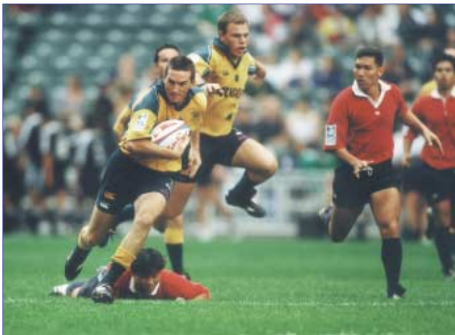
An inspirational performance by Australia ...

With 17 of the 24 teams participating in Argentina set to contest the US$150,000 prize purse at the 2001 Credit Suisse First Boston Hong Kong Sevens (March 30 – April 1) sevens enthusiasts in Hong Kong are in for a treat... RT