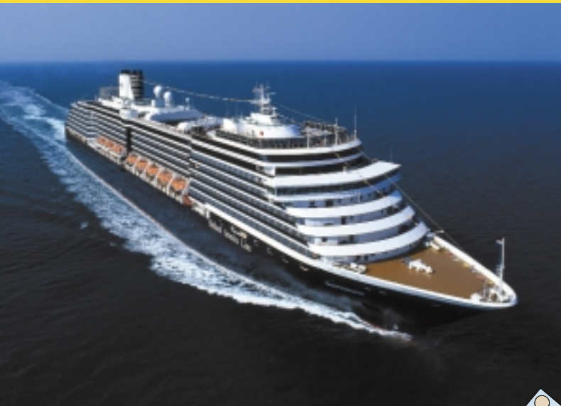
Outside w/Balcony cabins on the ms Zuiderdam are big on luxury: private verandahs, whirlpool baths, DVDs, and mini-bars.