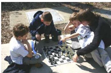
Chess is becoming a favorite American pastime.