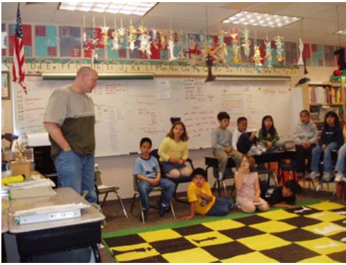
Highland Park students build life-size set.