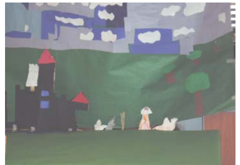
Students write and produce a chess puppet show to culminate the year.

Please send me more information on the following: