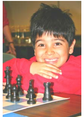
Classroom chess gives English Language Learners a way to communicate.

All it takes is $100. More than 20 schools patiently await funding for AF4C's classroom chess program. Send in your back-to-school gift by Sept. 30 and it will be matched by an anonymous donor!