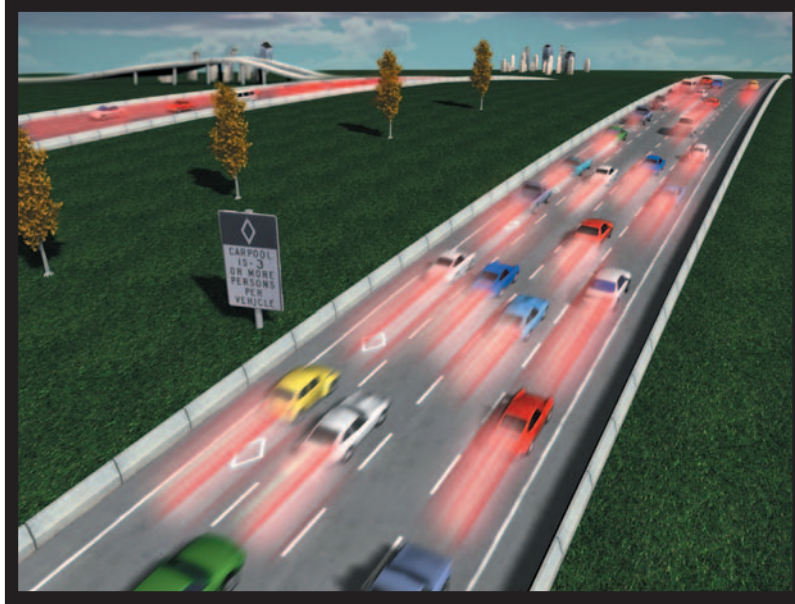
The scalable graphics solution with shared memory is like an easily configurable superhighway.