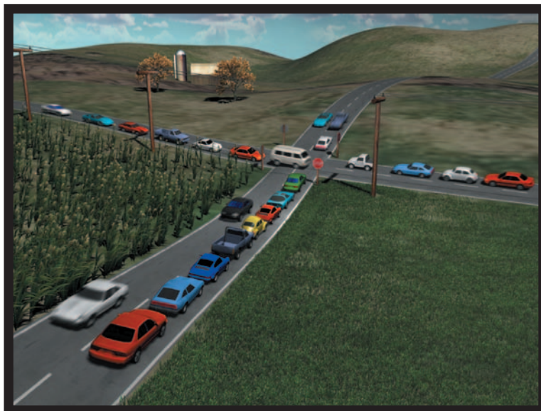
Traffic on a cluster architecture is similar to that on a country road. You can make good progress with limited traffic, but points of intersection on the road slow the pace. Additional traffic exacerbates the delays through the intersections.

Clusters are efficient solutions for applications that are composed of lots of small jobs, such as compute tasks that are parallelized. If a node can work on its part of the problem with minimal communication with other parts of the system, good performance is typical. If, however, the computational resources need to communicate with each other across the system interconnect to achieve the desired result, then the communication burden quickly stalls the performance of the individual resources in a cluster architecture. These stalls can slow down the image update rate to the point where interactivity is lost. You can think of this as traveling across the continent on a country road. With limited traffic, you can make good progress, but multiple cars on the road can easily create traffic jams and there are points of delay at intersections between roads. Simply adding another road to the route does not easily resolve the traffic delays because of the intersections.