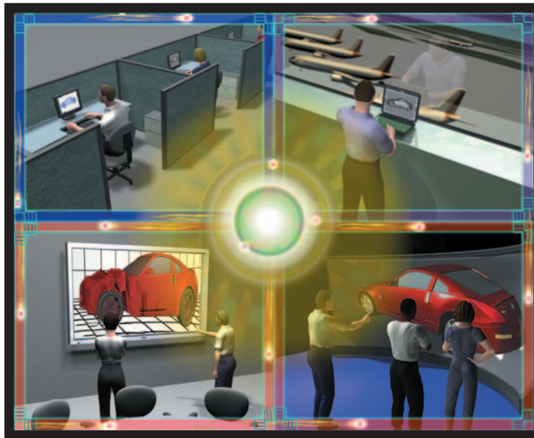
Multidisciplinary collaboration is a proven method for reducing the time to a quality solution. An ideal collaborative framework supports team members in a flexible manner.

Historically, visualization solutions have been based on high-performance system architectures built with special-purpose custom semiconductors and proprietary graphics boards. The graphics capabilities of these solutions can achieve very high levels of quality with the transformation of very large amounts of data into visual representations that are easily comprehensible. Users of these special-purpose technologies report dramatic productivity improvements and well-documented return on investment (ROI). Widescale adoption was limited, however, due to the expense of the solution, which typically exceeded $300,000 U.S..