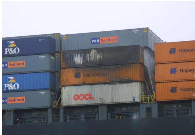
Photo 3. Fire Damaged Containers

On the morning of 24 March 2001, the Kitano was cleared by VTS to proceed to the container pier in Fairview Cove. At 0750, the vessel weighed anchor and under the escort of the Ryan Leet and two harbour tugs, proceeded to the Ceres container terminal. At 0940, the Kitano was secured alongside and the damaged containers as well as those adjacent to the fire were removed and inspected. Crews from both the Halifax Regional Municipality (HRM) Fire Service and the salvage company stood by the vessel until the following day as normal cargo operations resumed.