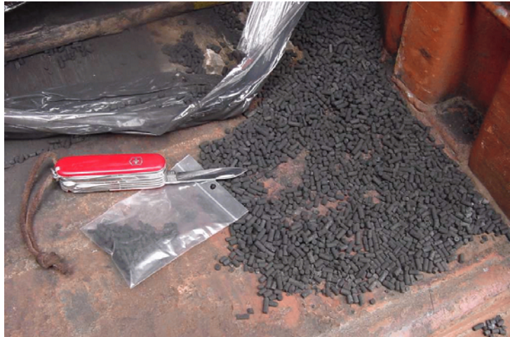
Photo 4. GC IPH Activated Carbon Pellets

The container in which the fire started contained 14 - 115 kg drums and 288 - 44 kg open mesh bags of activated carbon pellets impregnated with potassium hydroxide (caustic potash). The bags of carbon pellets were bundled and plastic wrapped onto 14 wooden pallets. The activated carbon pellets are commonly used for the desulphurisation of gases and the removal of acidic contaminants such as hydrogen sulfide, hydrogen chloride and mercaptans.