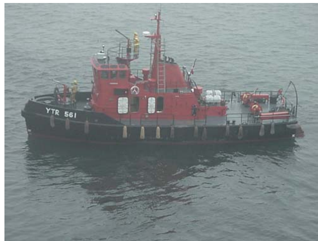
Photo 5. The CFAV Firebird

Immediately after the Kitano informed Halifax VCS of a container fire onboard, the JRCC assumed the role of SAR mission co-ordinator and tasked three surface units, the CFAV Firebird , the CCGS Earl Grey and the CCGC Sambro as well as three Department of National Defence (DND) SAR aircraft. Due to the extreme weather conditions, all the SAR resources were limited in their SAR capabilities. The three SAR aircraft were forced to return to their base to await improved weather conditions, the CFAV Firebird could only proceed as far as Maughers Beach while the CCGS Earl Grey and the CCGC Sambro were forced to heave to and monitor the situation. Several hours later the HMCS Moncton and the HMCS Goose Bay , with quickly assembled ad hoc fire teams, were tasked by the DND Military Operations Centre (MOC). At approximately 0500, the CCGS Sir William Alexander relieved the CCGS Earl Grey .