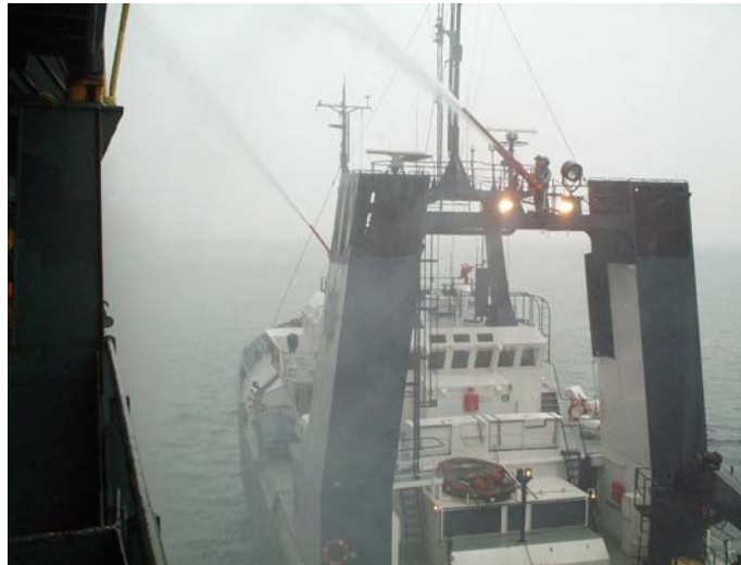
Photo 2. The Ryan Leet alongside the Kitano

With the vessel safely anchored, a four-man military fire team with thermal imaging equipment boarded the vessel to carry out a fire assessment. Shortly after the military fire assessment team boarded the vessel, a seven-person salvage fire team also boarded in order to assist with the firefighting efforts. At 1655, the Ryan Leet came alongside the Kitano and started to fight the fire in container 300986 using two fire monitors. At 1700, the vessel's crew was stood down and relieved by the seven fire fighters from the salvage company. At 1810, the vessel's crew rejoined the fire fighting effort and at 1940, the harbour pilot/liasion was relieved by his replacement. At 2050 the fire in container 300986 was confirmed extinguished. The final container (301186) was opened up at 2115, and one hour later at 2215, the last of the four (loaded) containers was confirmed extinguished. With the firefighting efforts now complete, the fire fighters as well as the Ryan Leet remained on scene to monitor the situation and relieve the vessel's own crew.