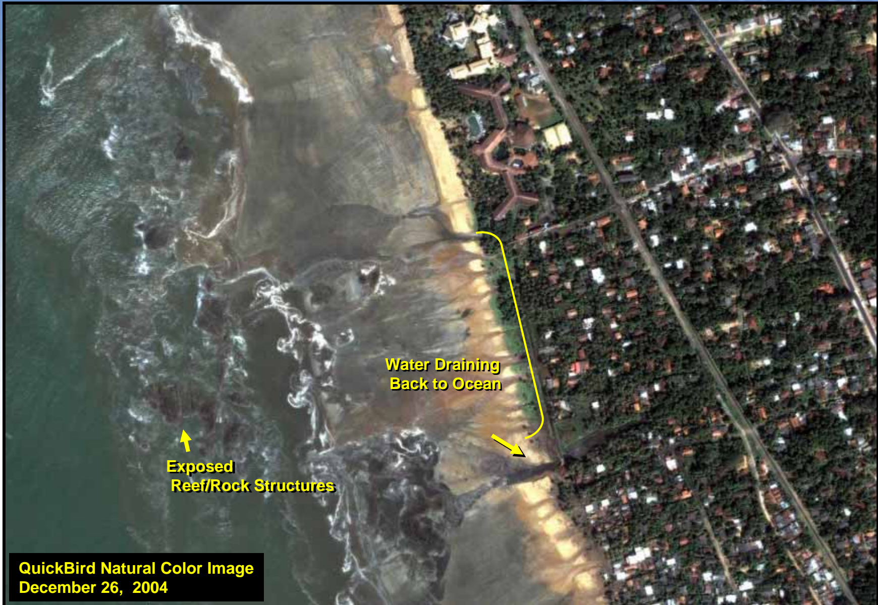
QuickBird Natural Color Image December 26, 2004