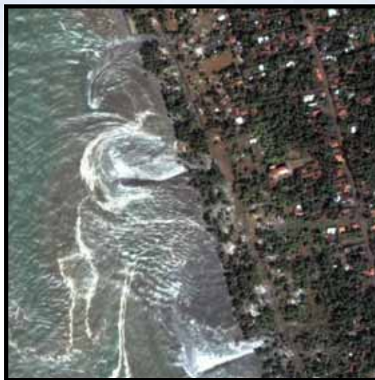
Swirling Ocean: South Kalutara, Sri Lanka