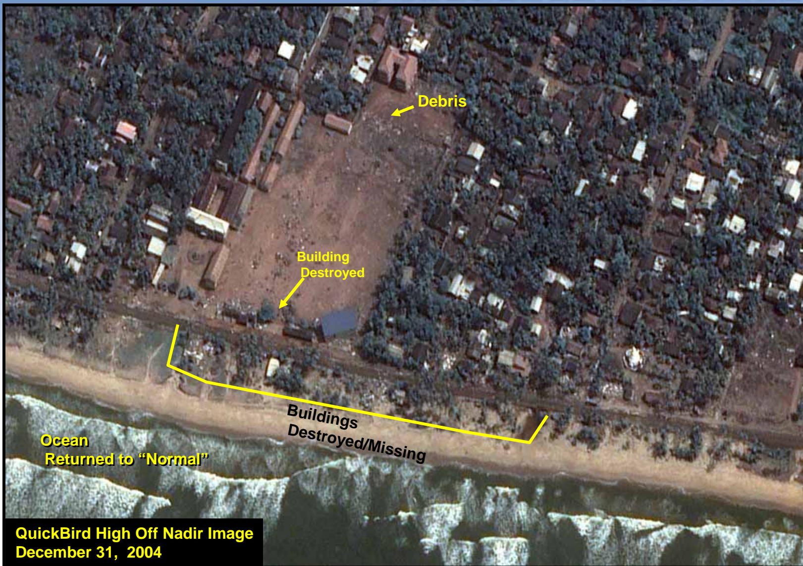
QuickBird High Off Nadir Image December 31, 2004