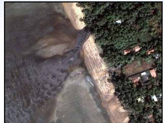
Water Draining Back to the Ocean