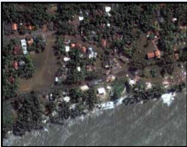
Flooded Roads, Villages: South Kalutara, Sri Lanka