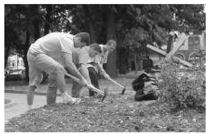
Volunteers from IPAK, an organization dedicated to youth programs, earn equipment for a community center by helping restore a city park.

riends of Bosnia's Community Service Program strengthens the fabric of the communities in which it works, as those who are helped by FOB offer help in turn to others in need. Our program is based upon the belief that straight charity is harmful to a person's spirit and self-respect and often causes a debilitating sense of dependency as well as resentment. Instead of charity, FOB's Community Service Program offers beneficiaries the opportunity to gener-