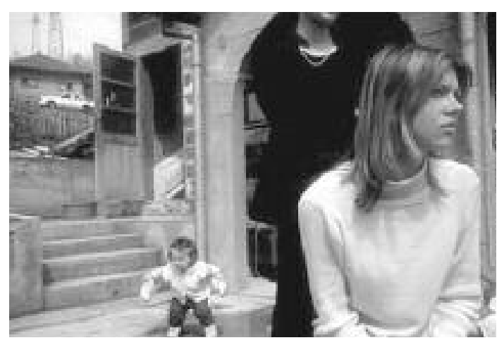
Exhibit on the Aftermath in Bosnia

By Svetlana Broz Translated by Ellen Elias Bursac 374 pages, hardbound $25.00 USD Plus $3.00 postage and handling (US delivery only) For international orders, please inquire about postage before sending order.