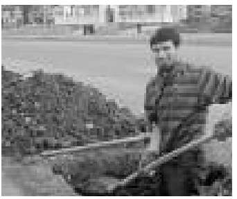
A volunteer from a student Internet club planting trees for the city.

For highlights of the work that our participant NGOs have been doing within The New Initiative and the benefits they have brought to their organizations and communities, please turn to page 3.