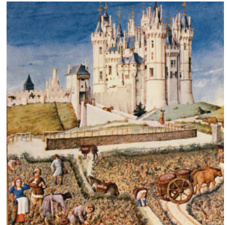
A fifteenth-century depiction of the grape harvest from Les Très Riches Heures du Duc de Berry , a medieval book of hours.

Our yearly reconstruction is significantly correlated (Table 1) with summer temperatures deduced from tree rings in central