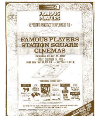
BOLEBY SPECTRAL STEREO IN ALL THEATRES = TWO 70MM THEATRES = GIANT SCREENS = LUXURIOUS SEATING WITH AMPLE LEG ROOM COMPLETE HANDICAP FACILITIES = ACCESS FROM METRO/TOWN SKYTRAIN STATION

6200 McKay Opened 1988 Owners: 1988 Famous Players 2005 Cineplex Galaxy Since 2002 Long Shong used one of the cinemas to show Chinese movies. Seating: Cinema 1 498 seats Cinema 2 413 seats Cinema 3 285 seats Cinema 4 202 seats Cinema 5 202 seats Cinema 6 202 seats Cinema 7 196 seats Total 1998 seats