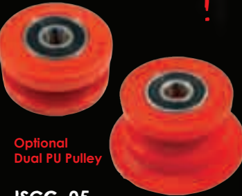
Optional Dual PU Pulley