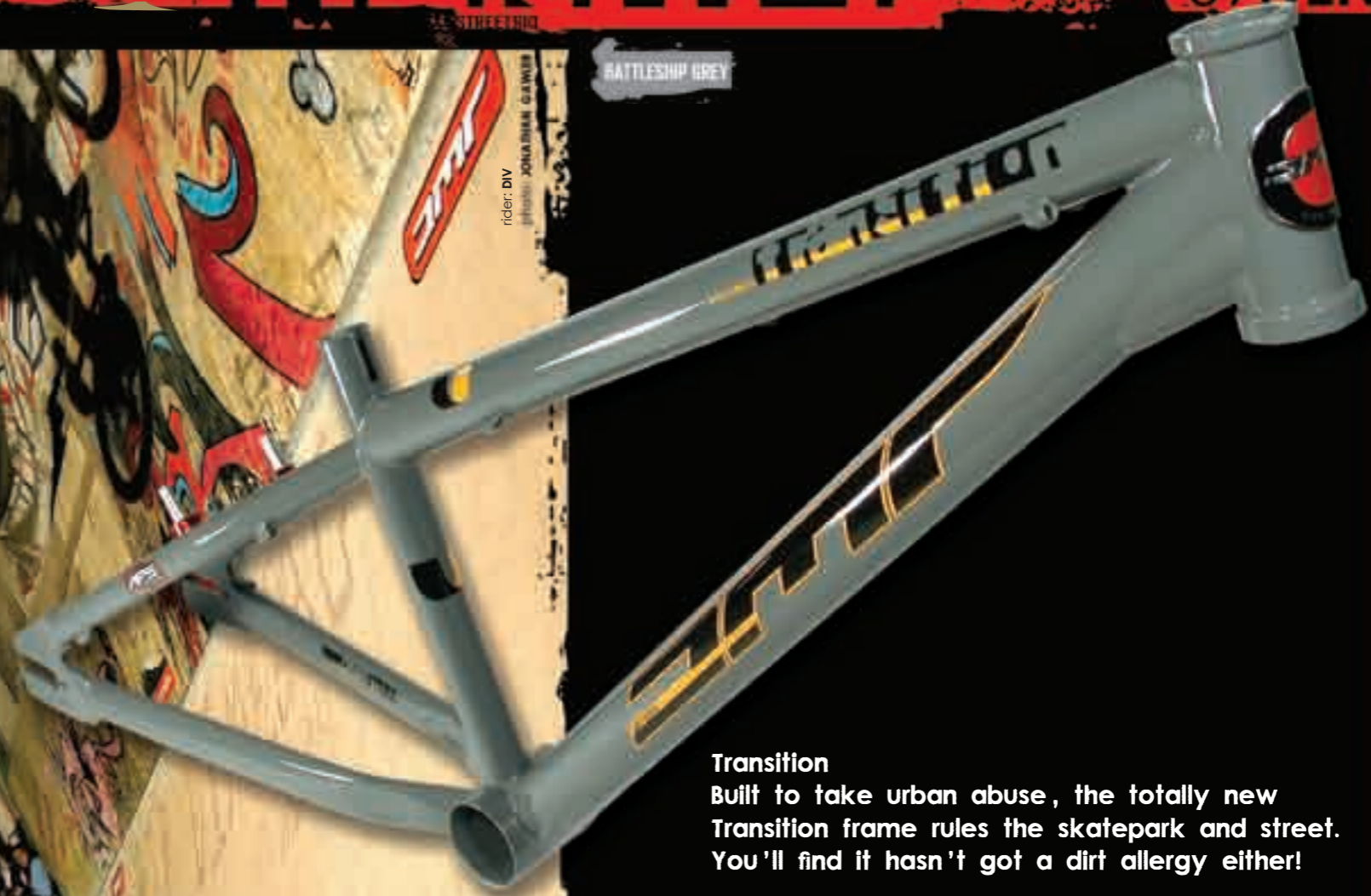
rider: DIV