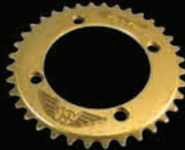
10 YEAR SATURN RING Gold Anodised ring, engraved with 10 year Wings logo. Sizes 4 bolt 36T and 38T only