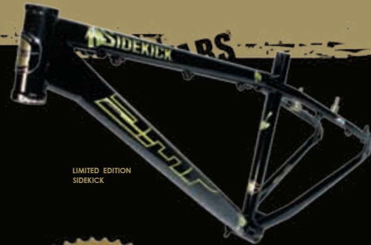
LIMITED EDITION SIDEKICK