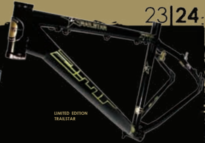
LIMITED EDITION TRAILSTAR