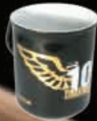
10 YEAR MUG Gold Metallic print with 10 year wings logo design on a black mug with a white inside