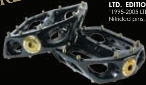
LTD. EDITION 10YEAR V12 MAG '1995-2005 LTD Edition' Gold end caps, Gold Nitrided pins, Special Gloss Black Finish.