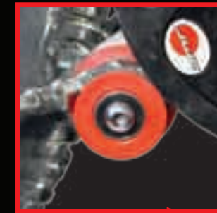
Standard PU Pulley

run the optional Dual pulley and a Sideplate to keep the chain on and the tension constant in both front gears.