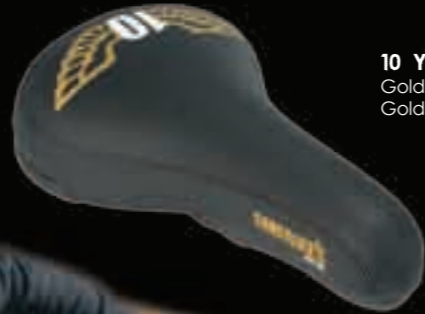
10 YEAR DIRT SADDLE Gold embossed 10 year wing logo, and a Gold 'DMRBIKES Since 1995' nose logo