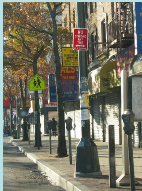
Typical Sidewalk details along Flatbush Ave