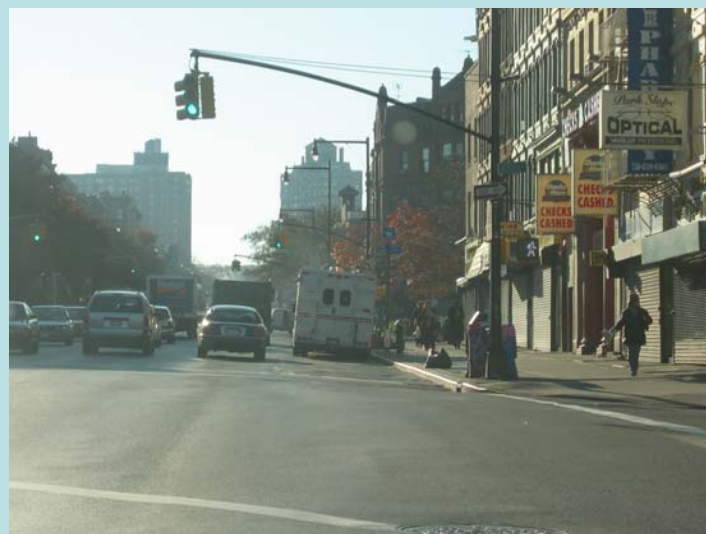
On-Street conditions at Downtown Brooklyn