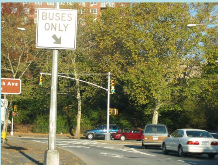
Bus Only Lane at Grand Army Plaza