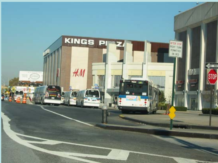
Bus Terminus at Kings Plaza