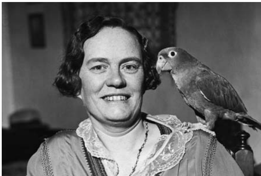
Margaret Mead, elected 1948