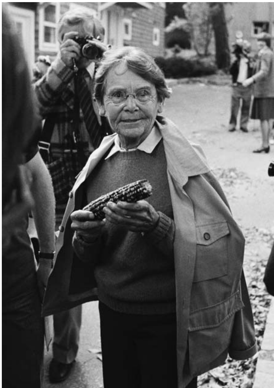
Barbara McClintock, elected 1959