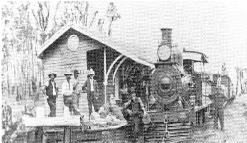
Innisplain Tramway closed in 1944.

The Tramway and School Monuments were erected by the Rathdowney Area Development and Historical Association Inc in conjunction with the Beaudesert Shire Council.