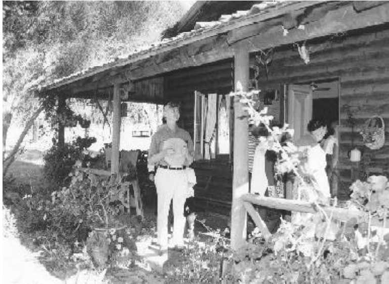
Cottage at Barney Creek Tree Farm.