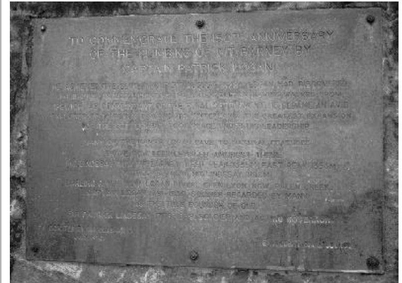
This plaque was erected to commemorate the 150th anniversary of the climbing of Mount Barney by Captain Patrick Logan in 1828.