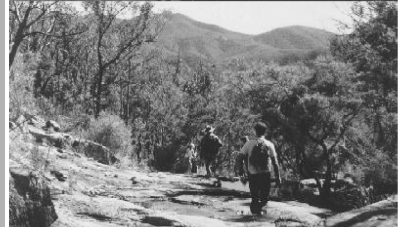
Abseiling and Bushwalking are two of the many activities to be enjoyed at Mount Barney National Park.