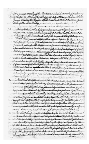
Written on July 17, 1774, the Fairfax County Resolves were both a bold statement of fundamental constitutional rights and a revolutionary call for an association of colonies to protest British antiAmerican actions.

Attributing the Resolves to only Mason and Washington, Sweig argued, "would suggest that the radical sentiments the document expressed were primarily those of only one or two members of Fairfax County's ruling elite-later endorsed by their social inferiors-rather than the feelings of an aroused populace."