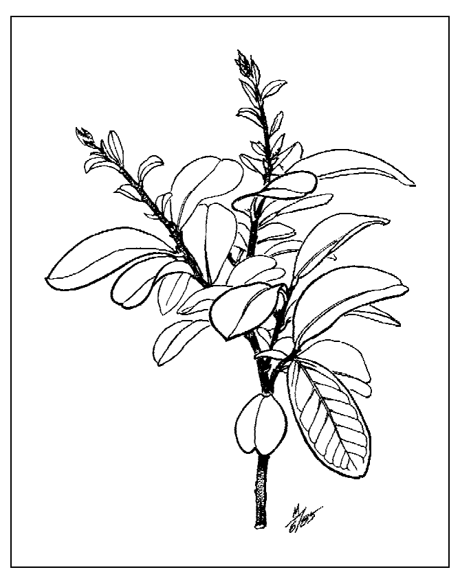
Figure 3. Foliage of Crape-Myrtle.