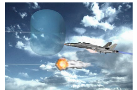
Conventional proximity mode