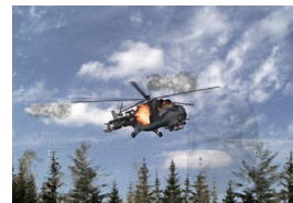
Gated proximity mode with impact priority