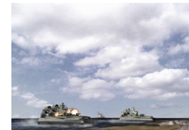
Armour piercing mode