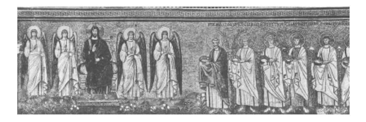
Fig. 9: Ravenna, St. Apollinaris Nouvo (c. 500 – c. 561), south nave wall, Christ as Ruler (after Kitzinger 1995: Fig. 106).

connection with the ancients resulted not only in the erection of new edifices, but also in his dedication to the restoration of old ones.<sup>51</sup> In his opinion even the new buildings should imitate those of the Roman past and thus revive the grand days of the Roman Empire, as he himself writes: "Nothing but the newness of the buildings must distinguish them from the constructions of the ancients",<sup>52</sup> and elsewhere "Let us not lag behind the ancients' desire for adornment".<sup>53</sup>