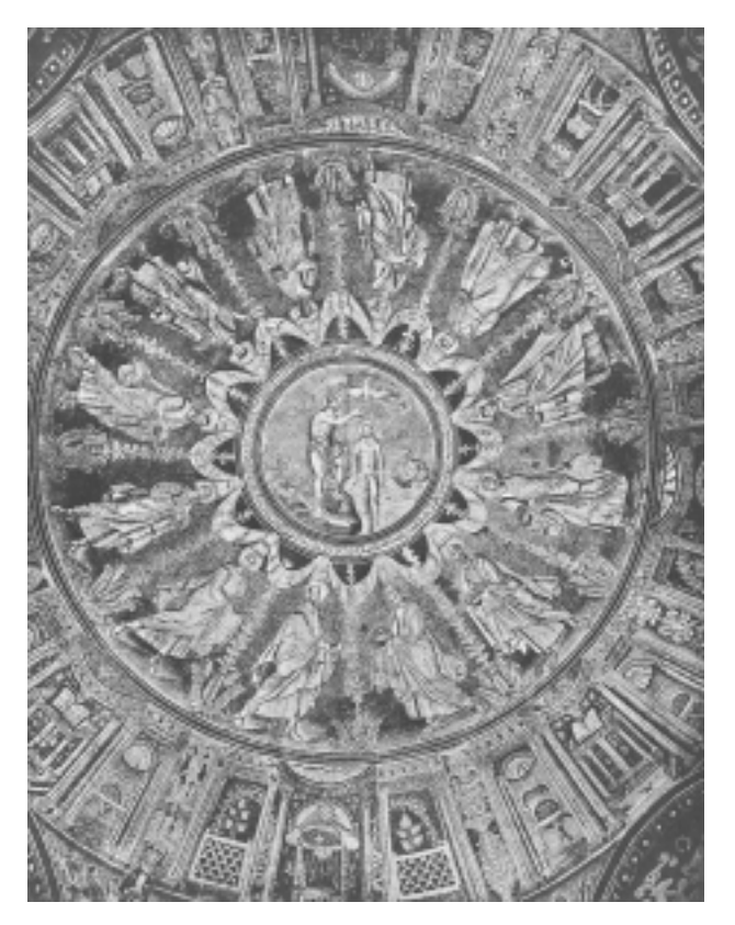
Fig. 2: Ravenna, The Orthodox Baptistery (c. 451), Dome (after Kostof 1965: Fig. 42).

representations, in order to characterize the Orthodox conception vis-à-vis the Arian in Ravenna, became part of the canonic teaching of Early Christian art.<sup>2</sup>