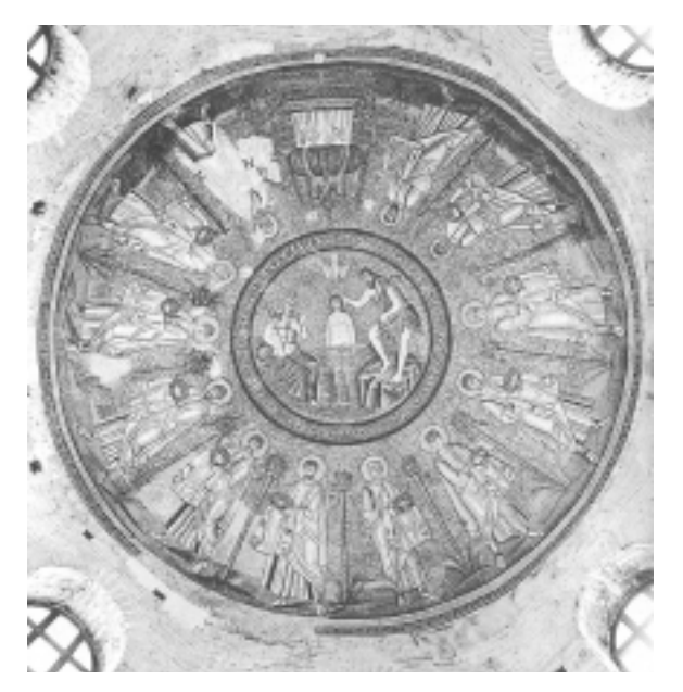
Fig. 1: Ravenna, The Arian Baptistery (first quarter 6<sup>th</sup> century), Dome (after Kitzinger 1995 [1976]: Fig. 104).

It has been commonly observed that the mosaic program in the dome of the Arian Baptistery (Fig. 1) is a modification of the representation similarly located in the Neonian Baptistery (Fig. 2).<sup>1</sup> A comparison between the two