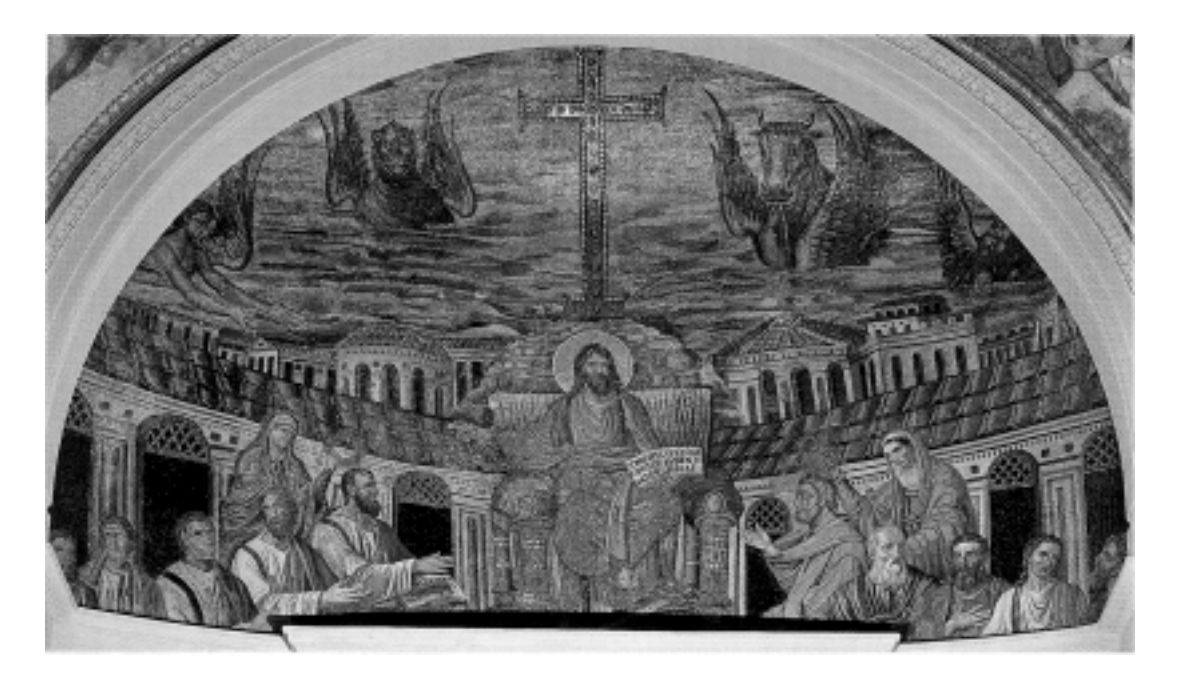
Fig. 7: Rome, Sta. Pudenziana (c. 390), apse (after Elsner 1998: 232).

The impact of the patron can also be traced in the presentation of the Apostles' procession in the Arian Baptistery. The procession, lead by St. Peter and St. Paul, is advancing towards the empty throne with the cross. The dove hovering (upside-down) above the scene of the Baptism seems to be standing above the throne, dignifying it with its symbolic divinity.