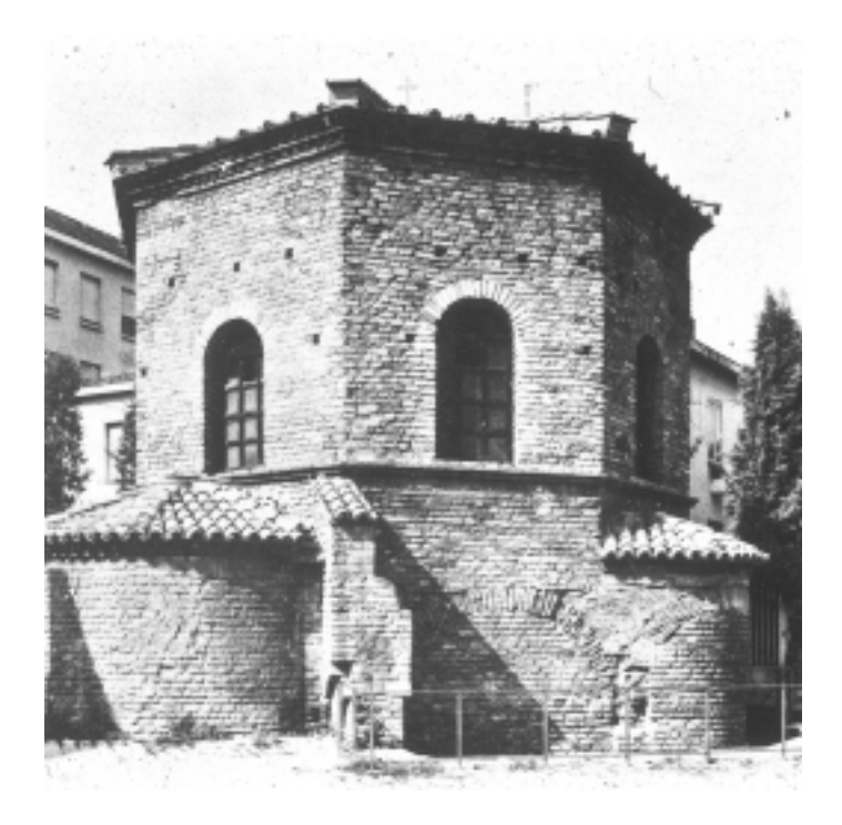
Fig. 5: Ravenna, The Arian Baptistery, exterior from the northeast (after Wharton 1995: 115).

In this compound the Arian cathedral (known today as Spirito Sancto) was dedicated to the Anastasis,<sup>16</sup> as was the Orthodox cathedral before it. Over the years, the Arian cathedral received the name Anastasis Gothorum in contrast to Anastasis Catholicorum , which was also known as the Orthodox cathedral.<sup>17</sup> Thus, there was a close link between Arianism in Ravenna and the Goths.. It is therefore quite reasonable to conclude that Theoderic, the powerful Arian ruler of Ravenna, was the initiator of the Arian compound, if not its direct patron.