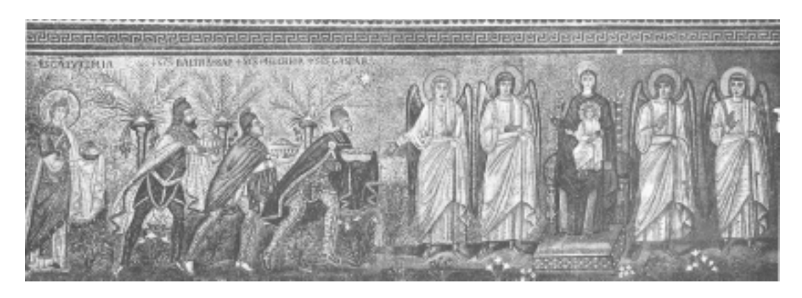
Fig. 10: Ravenna, St. Apollinaris Nouvo (c. 500 – c. 561), north nave wall, Christ on Mary's lap (after Simson 1948: fig. 31).

turning away to leave the occurrence. A few years later, on the Orthodox Bishop Maximian's throne (Fig. 10), the personified image of the Jordan would be trod beneath the feet of the baptized Christ.<sup>62</sup>