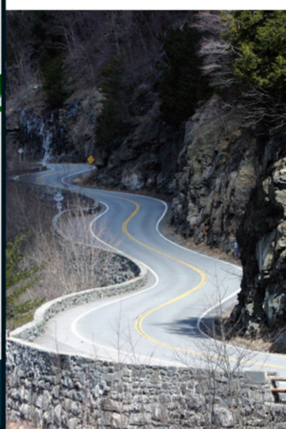
NO. 22: New York's Rte. 97 traces the Delaware.

much traffic. But, you can wind up your car's engine and suspension, and test its tires and your nerve along this less crowded stretch, which runs near the eastern border of the Green Mountain National Forest. Blind bends keep you honest. Waterbury to Killington: Rte. 100—50 miles