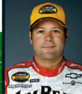
Robby Gordon DRIVER OF THE NO. 7 HARRAH'S CHEVROLET MONTE CARLO

PHOTOGRAPHS BY GARI WYN WILLIAMS/ALAMY (TIRE TRACKS); RUSTY JARRETT/GETTY IMAGES (KASEY KAHNE); ROBBY GORDON (PHOTOGRAPHS BY WENDI PEGLE/WPN (RM 1431), DOUG PENNINGER/GETTY IMAGES (MOUNTAIN ROAD), NADAV NEUHAUS/WPN (RTE. 97), CHRIS STANFORD/GETTY IMAGES (KURT BUSCH); DAN HANSEN/ARND BRONKHORST/GETTY IMAGES (RTE. 89A)