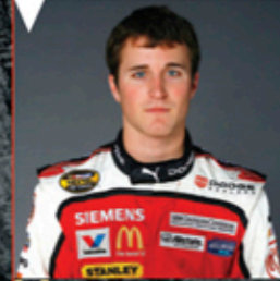
Kasey Kahne DRIVER OF THE NO. 9 DODGE DEALERS/UAW CHARGER

1 SCHOOL DAZE "I used to drive my buddies to school in our old farm truck up Mud Mountain Road, near Enumclaw, Wash. It's narrow with sharp bends. Believe me, we'd all be wide-awake when we got to school."