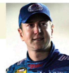
Kurt Busch DRIVER OF THE NO. 2 MILLER LITE DODGE CHARGER

24 ALPINE NEW ENGLAND The well-kept Kancamagus Highway recalls Europe's mountain roads as it climbs, falls and twists through New Hampshire's rugged White Mountains. While it's an exhilarating summer drive, you get extra credit if you tackle it in the snows of winter. Lincoln to Conway: Rte. 112—35 miles