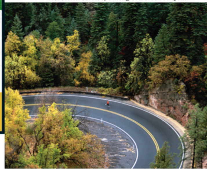
NO. 5: Rte. 89A loops along Oak Creek Canyon.

miles of too-tight hairpins working out of Arizona's Oak Creek Canyon. Sorry, no time to gawk at the red rock. (See page 80.) Prescott to Flagstaff: Rte. 89A—85 miles