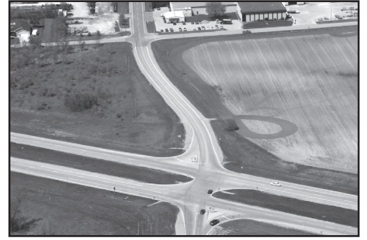
The plan development team is working to minimize impacts to properties along WIS 29 while maintaining safety and mobility.