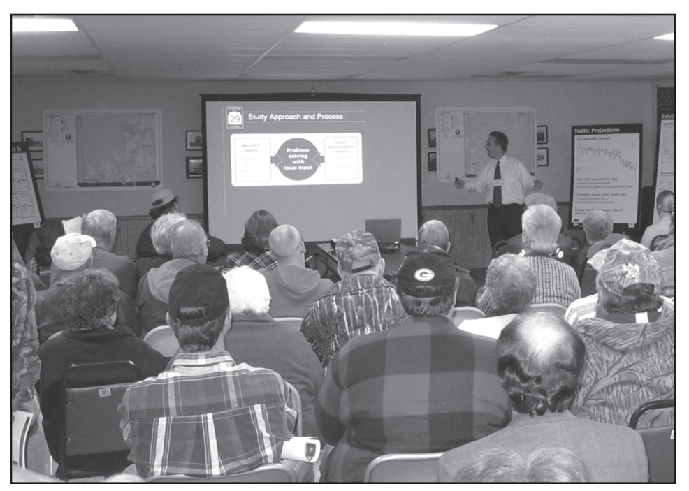
The plan development team presented information to Shawano County residents and stakeholders at informational meetings last fall and workshops during winter and spring.

After the public information meeting, the team will update the concept plans and prepare a recommendation on the preferred plan to present to the Stakeholder Committee later this year. Following this recommendation, team members will begin preliminary engineering and prepare an EA that will evaluate the impacts of the recommended plan in greater detail.