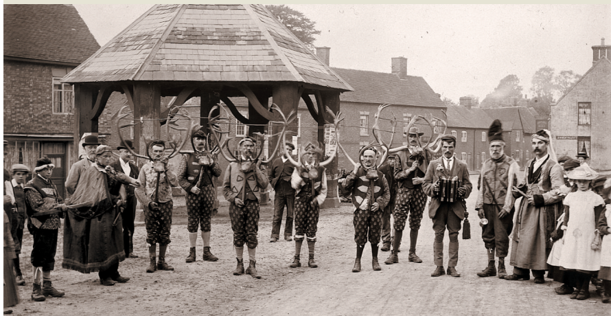
The Abbots Bromley Horn Dancers in 1901. There is a GENUKI subject heading devoted to Folklore.

most websites, it is "distributed", which means the material is not all on the same web server; different parts are hosted in the web space of the individual volunteers. So although the main web address for Genuki is www.genuki.org.uk where all the general material is kept, many of the county sections have different addresses. (This means, incidentally, that when there is a technical problem in one area of the site, other parts are not affected.)