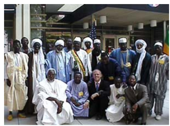
Malian Delegation of Imams, Scholars and Hgh officials at the PeaceCorps reception

troducing an alternative method of learning based on traditional African teaching methodology.