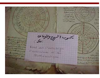
Manuscripts on Astronomy

The brittle condition of the manuscripts: the pages disintegrating easily like ashes, termites, other insects, weather, piracy of the manuscripts, and selling of these treasures to tourist for food money pose a serious threat to the future of the manuscripts of Timbuktu.