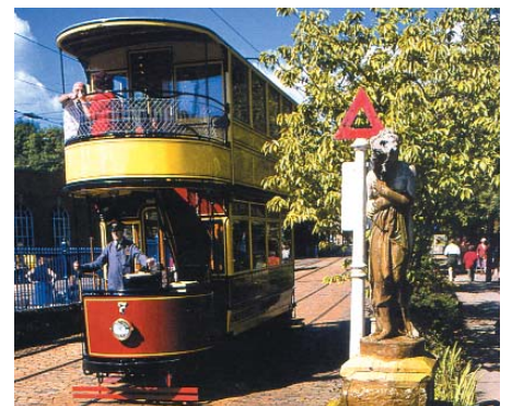
National Tramway Museum