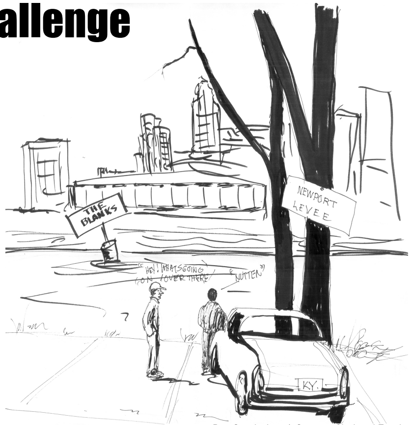
Don Cunningham / Courtesy Cincinnati Enquirer