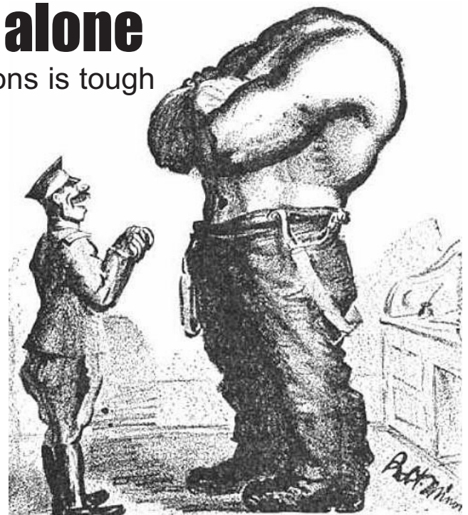
Army Medical Examiner: "At last a perfect soldier!" by Robert Minor, July 1916, New Masses magazine

http://catalog.socialstudies.com/c/@VHTRG6DJWN8gc/Pages/product.html?record@TF26894