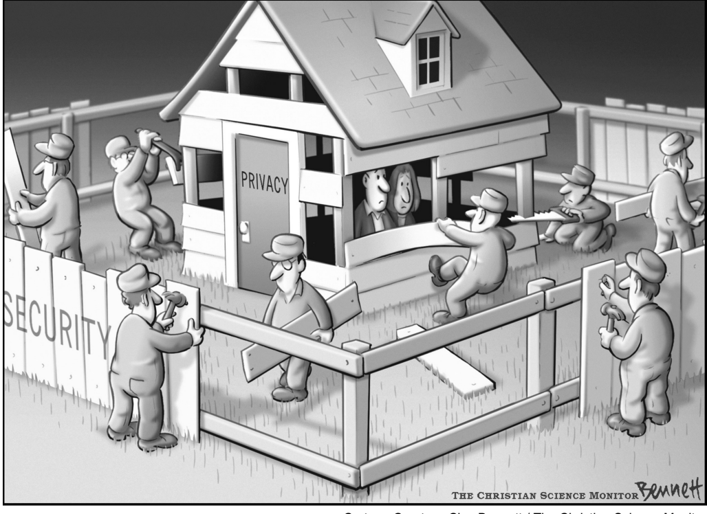
Cartoon Courtesy Clay Bennett / The Christian Science Monitor

The issue of curbing civil liberties in the name of national security has been argued vigorously in the wake of the 9/11 attacks and the passage of the Patriot Act . Should people be willing to give up certain liberties protected by the Constitution and the Bill of Rights in exchange for protection against terrorism?