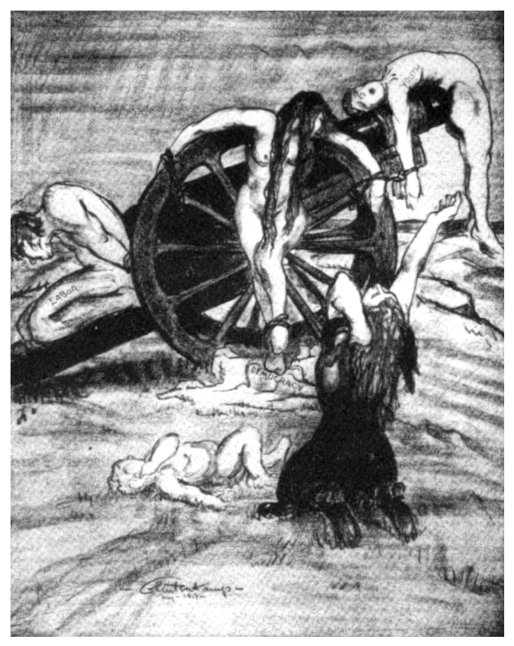
Conscription: Death surrounds a cannon in this protest of the draft that was proposed in preparation for World War I. Henry Glintenkamp / The Masses, August 1917

The cartoons on this page were cited as examples of seditious material in a trial of The Masses, a magazine that protested U.S. participation in World War I. The government put the magazine on trial in 1917 for violating the Espionage Act. Part of that new law empowered the Post Office to withhold from the mail any material promoting "treason, insurrection or forcible resistance to any law of the United States." Since The Masses could not afford to keep publishing without access to the mails, the magazine went out of business. The Masses fell victim to wartime censorship.