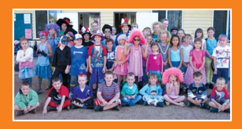
costumes for the St Vincent de Paul fundraising da

Students at St Patrick's School in Winton have been involved in some fantastic fundraising initiatives during Term 2. To raise money for St Vincent de Paul, the school held a 'Crazy Dress' day, which certainly added some colour to an otherwise normal Friday! The Year 5/6/7 classes also took the initiative and held a car and dog washing morning to raise funds for their camp. A very wet morning's work raised $308... with some sparkling dogs and cars as a result.