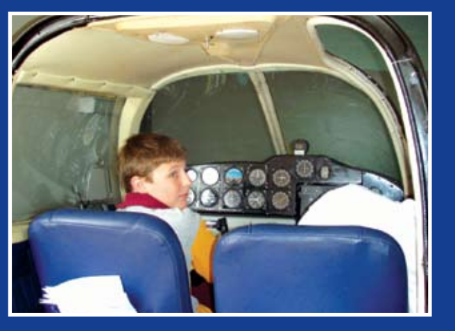
11 student lain Davidson enjoys the flight simulator experience at Good Shepherd Catholic College in Mount Isa