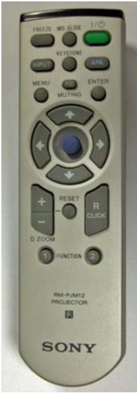
Data projector remote control